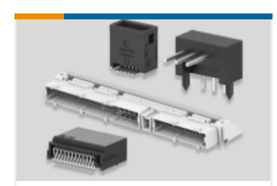
PCB Headers & Receptacles(314)