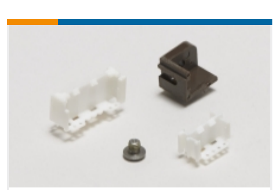
PCB Connector Mounting(1)