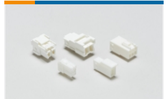
Rectangular Power Connectors (698)