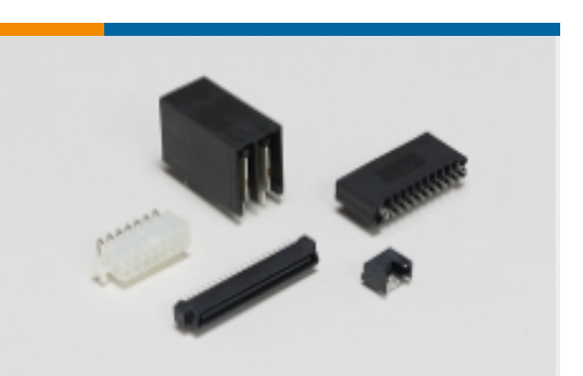
Standard Rectangular Connectors(337)