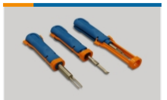
Insertion & Extraction Tools(1)