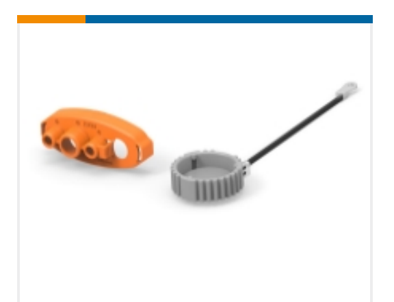
Connector Caps & Covers(88)