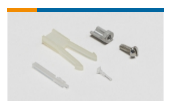
PCB Connector Keying(2)