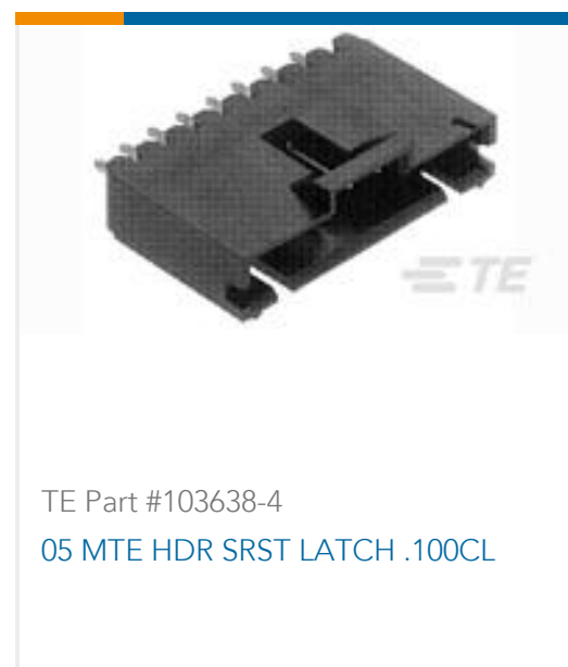
TE Part #103638-4 05 MTE HDR SRST LATCH .100CL