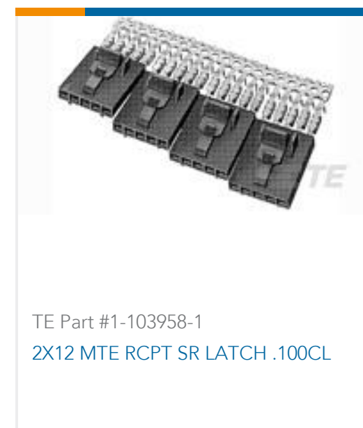
TE Part #1-103958-1 2X12 MTE RCPT SR LATCH .100CL