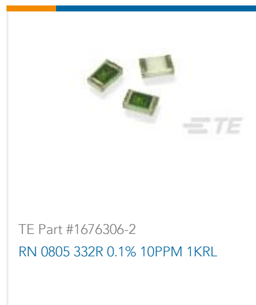
TE Part #1676306-2 RN 0805 332R 0.1% 10PPM 1KRL