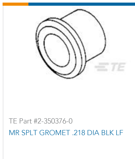
TE Part #2-350376-0 MR SPLT GROMET .218 DIA BLK LF