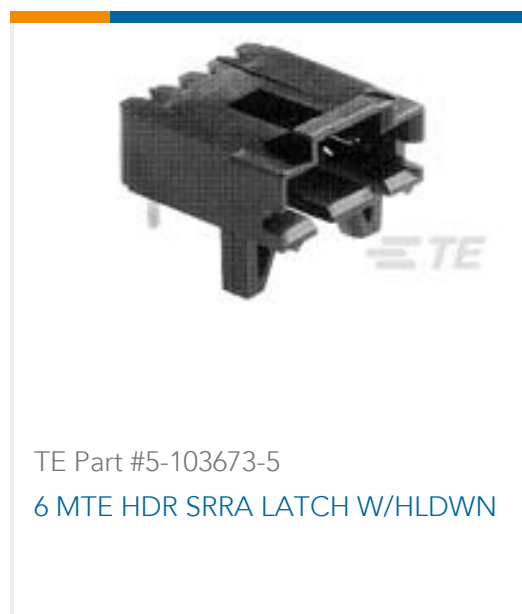
TE Part #5-103673-5 6 MTE HDR SRRA LATCH W/HLDWN