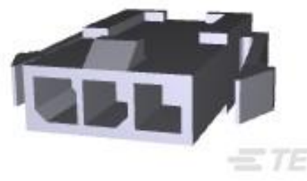
TE Part #1445048-3 PANEL MT SNGL ROW HSG 3 POS