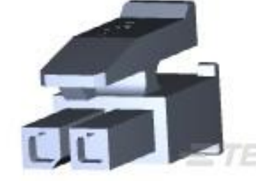
TE Part #1445022-2 MICRO MNL RECEPT HSG SINGLE R