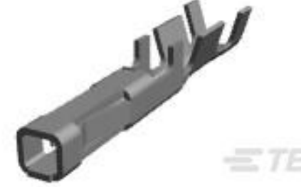
TE Part #794610-1 MICRO MNL RPT CNT,LS PC,TIN