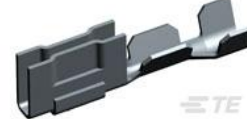
TE Part #1375819-2 CST-100 II CONTACT 15 GOLD PLT