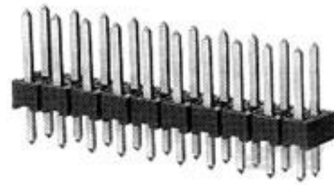
TE Part #5-146254-3 06 MODII HDR DRST B/A .100CL