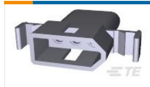
TE Part #770073-1 03P .093 COMM P&S PLUG HSG