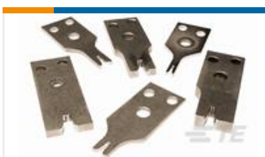
TE Part #6-683453-4 CRIMPER, INSULATION "F"(.059")