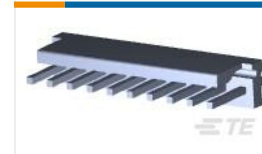
TE Part #4-641208-0 10P MTA156 HDR ASSY FL ST LF