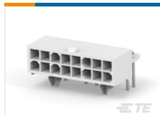
TE Part #1586821-2 16P MINI UMNL RA HDR ASY OMIT