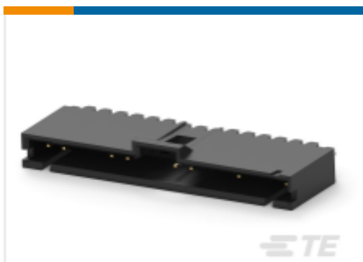
TE Part #5-104912-2 08/16 MTE HDR SRST LTCH .100CL