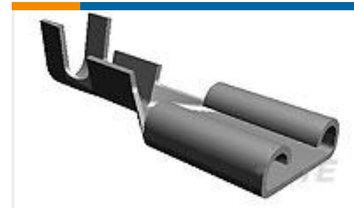
TE Part #42400-2 250 FASTON REC 18-14 AWG TPBR