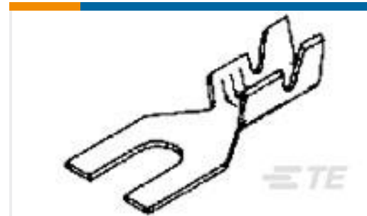
TE Part #60775-1 SPADE TERMINAL 18-14 AWG BR