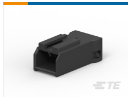
TE Part #2219340-2 GLASS ANT 250 1P CAP HSG