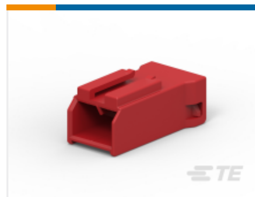
TE Part #2219340-6 GLASS ANT 250 1P CAP HSG RED