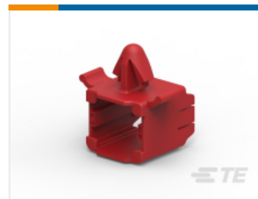
TE Part #2219589-6 CLIP FOR GLASS ANT 250 1P RED