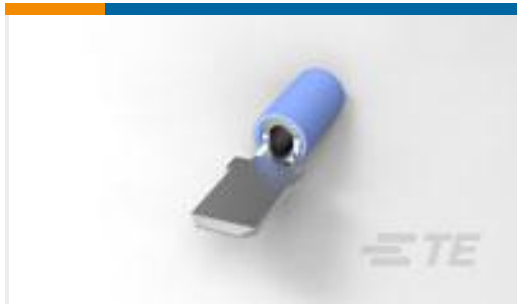
TE Part #66024-2 TAB, PIDG TERMINAL-BK 16-14