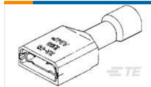
TE Part #3-350815-2 ULTRA-FAST 187 ASY REC 16-14 AWG TPBR