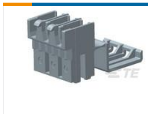
TE Part #1-1703082-1 3POS MT - EDGE HOUSING