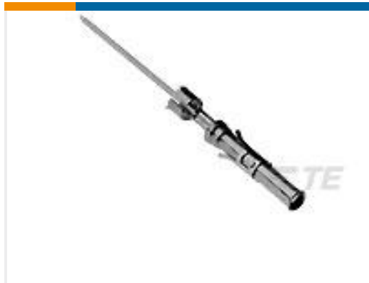
TE Part #5-66461-9 SKT,.062 DIA,.025 SQ POST,LP