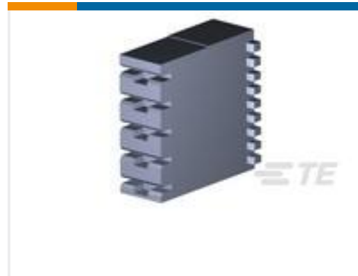
TE Part #521207-1 POSI-LOK HSG.250-5 POS RAST5