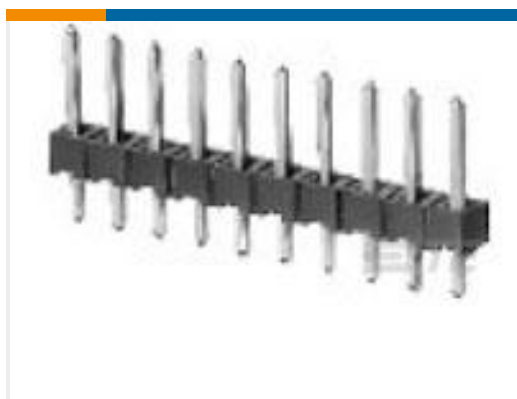
TE Part #5-146277-8 08 MODII HDR SRST B/A .100CL