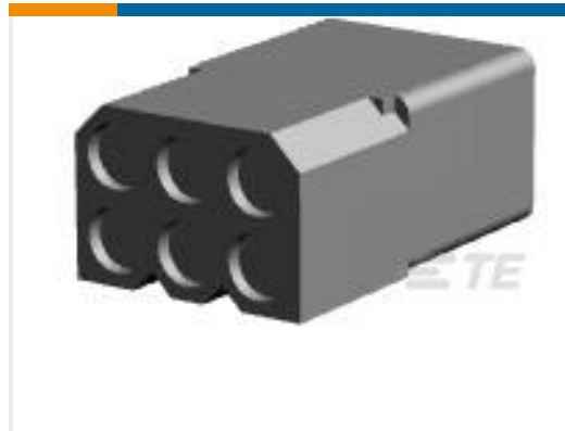
TE Part #770088-1 06P .093 COMM P&S RECPT HSG