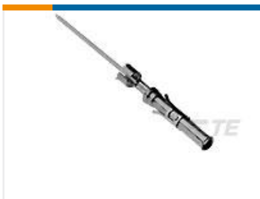
TE Part #1-66473-7 SKT,.062 DIA,.045 SQ POST,LP