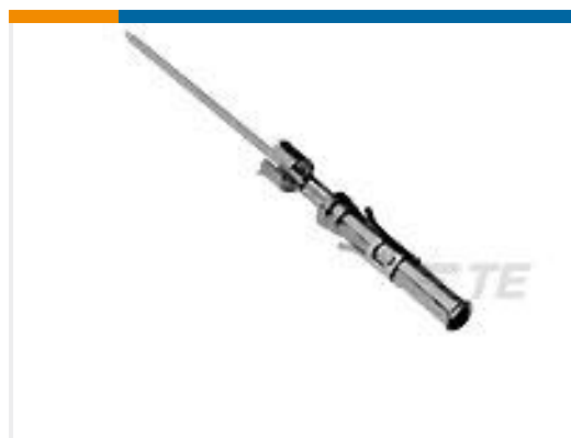
TE Part #1-66473-8 SKT,.062 DIA,.045 SQ POST,LP