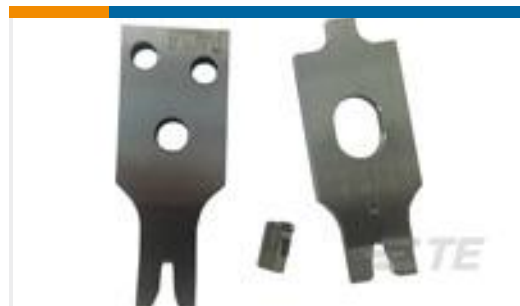
TE Part #7-2266297-7 OCEAN_2.0_SPARE_PART_KIT-090F1400