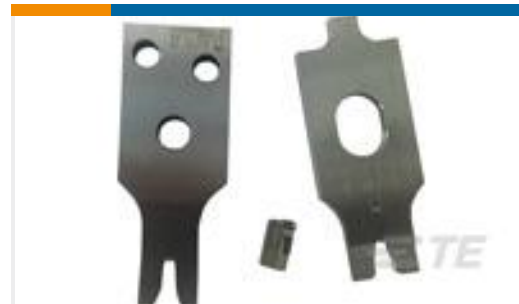
TE Part #7-2151227-7 OCEAN_2.0_SPARE_PART_KIT-080F1600