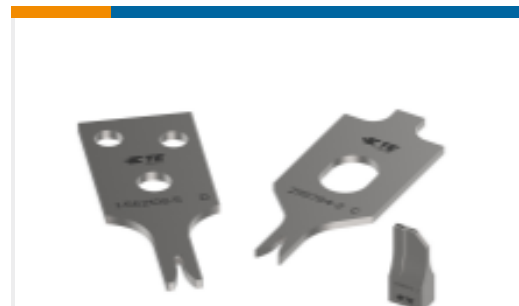
TE Part #7-2266487-7 OCEAN_2.0_SPARE_PART_KIT-095F100F