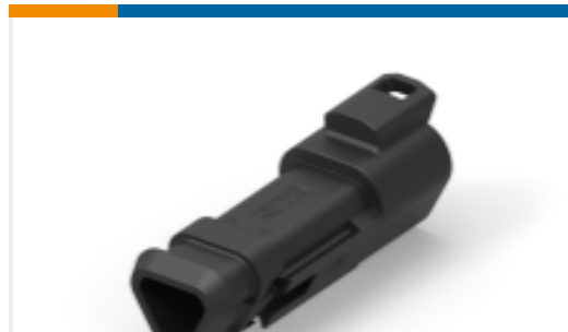
TE Part #2600026-3 3CCT BLACK RECEP W/SMALL SEAL & HS