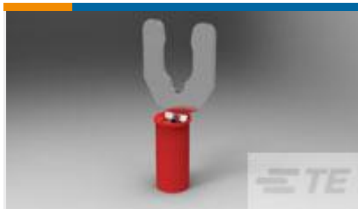
TE Part #52931-1 TERMINAL,PIDG SPR SPD 22-16 10