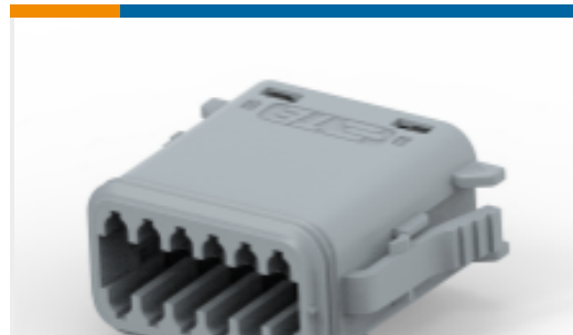
TE Part #2600043-7 12CCT PLUG GREY K A W/LARGE SEAL