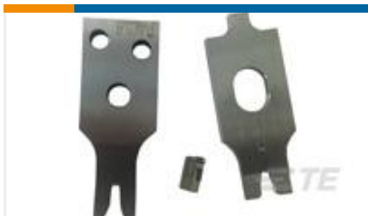
TE Part #7-2151649-7 OCEAN_2.0_SPARE_PART_KIT-080F1000V