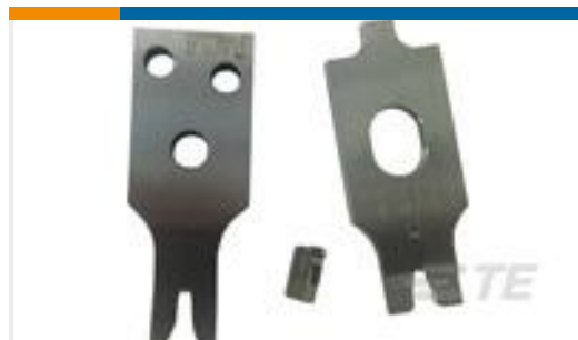
TE Part #7-2151785-7 OCEAN_2.0_SPARE_PART_KIT-078F102F