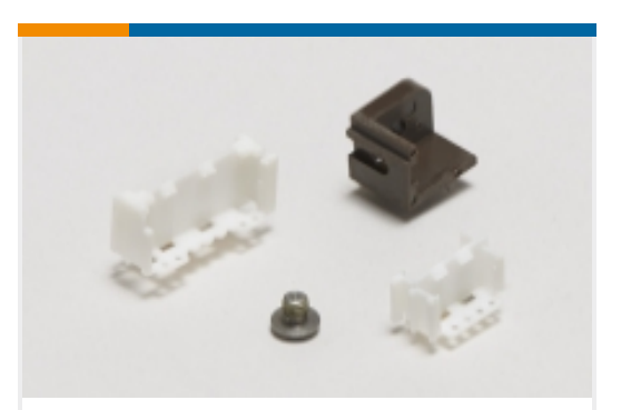
PCB Connector Mounting(2)