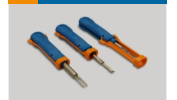
Insertion & Extraction Tools(2)