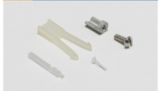
PCB Connector Keying(1)