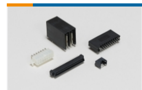
Standard Rectangular Connectors(1)