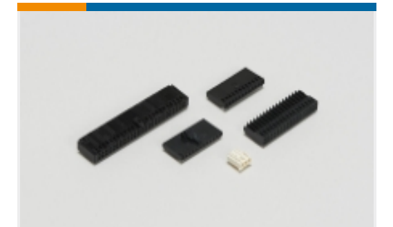
Wire-to-Board Connector Assemblies & Housings(157)