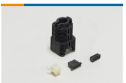
Rectangular Connector Housings(2)