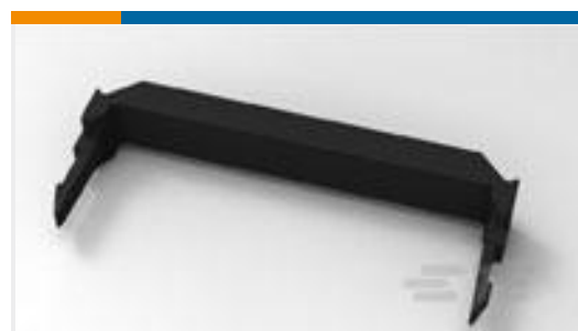
TE Part #499252-8 016 STRAIN RELIEF A-L RCPT