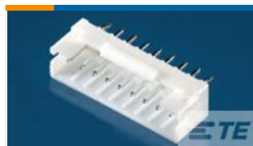
TE Part #1-1735446-2 2MM PITCH HPI POST HEADER, VERTICAL, 12P