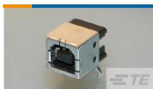
TE Part #292304-1 STD USB TYPE B, R/A, T/H