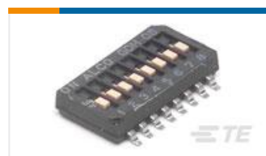
TE Part #1571983-4 GDH04S04=DIP SWITCH