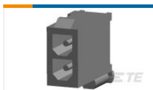
TE Part #1-770166-1 02P MINI UMNL ASSY VO SNAU LF