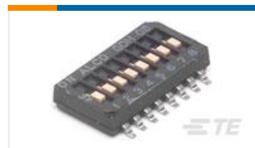
TE Part #1-1571983-0 GDH08S04=DIP SWITCH