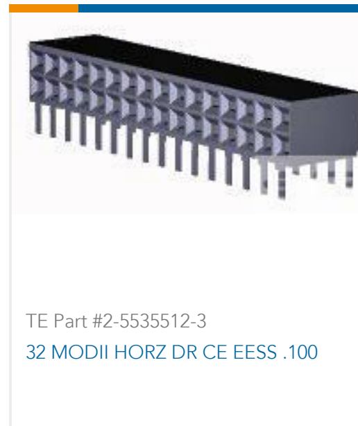
TE Part #2-5535512-3 32 MODII HORZ DR CE EESS .100