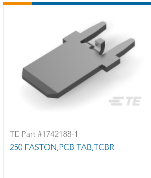
TE Part #1742188-1 250 FASTON,PCB TAB,TCBR