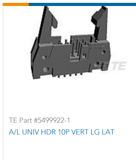
TE Part #5499922-1 A/L UNIV HDR 10P VERT LG LAT