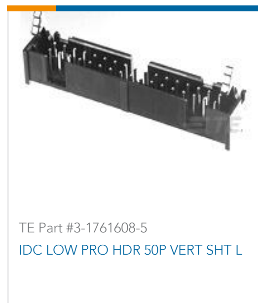
TE Part #3-1761608-5 IDC LOW PRO HDR 50P VERT SHT L