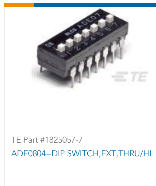
TE Part #1825057-7 ADE0804=DIP SWITCH,EXT,THRU/HL