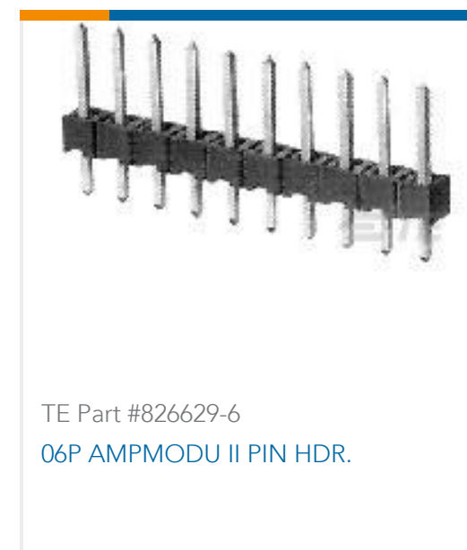
TE Part #826629-6 06P AMPMODU II PIN HDR.