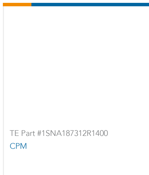
TE Part #1SNA187312R1400 CPM