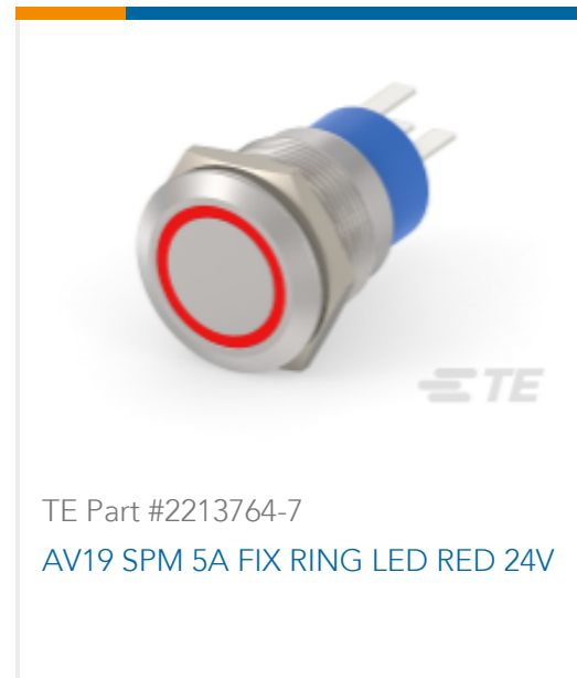
TE Part #2213764-7 AV19 SPM 5A FIX RING LED RED 24V