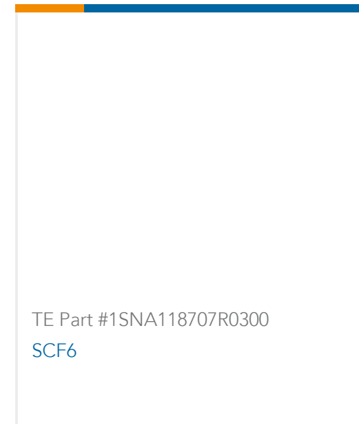
TE Part #1SNA118707R0300 SCF6