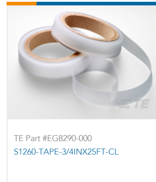
TE Part #EG8290-000 S1260-TAPE-3/4INX25FT-CL