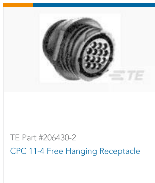
TE Part #206430-2 CPC 11-4 Free Hanging Receptacle