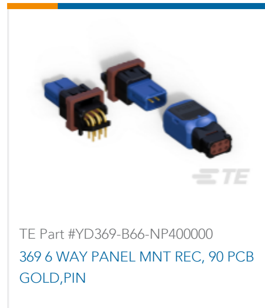
TE Part #YD369-B66-NP400000 369 6 WAY PANEL MNT REC, 90 PCB GOLD,PIN