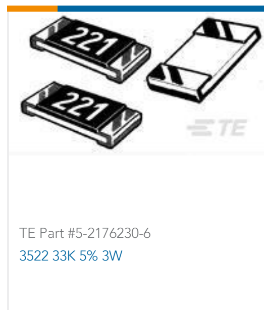
TE Part #5-2176230-6 3522 33K 5% 3W