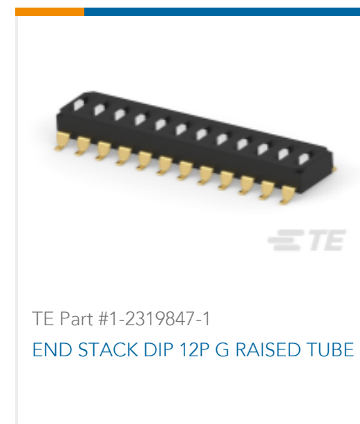
TE Part #1-2319847-1 END STACK DIP 12P G RAISED TUBE