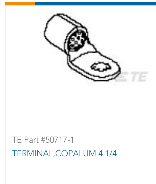
TE Part #50717-1 TERMINAL,COPALUM 4 1/4