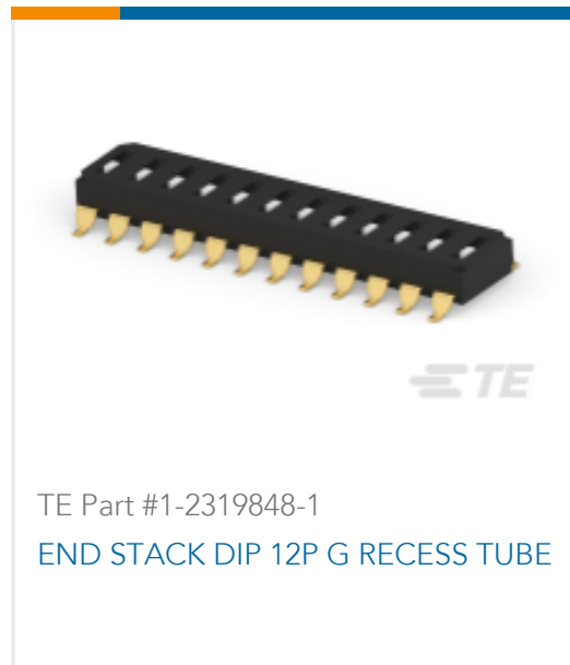
TE Part #1-2319848-1 END STACK DIP 12P G RECESS TUBE