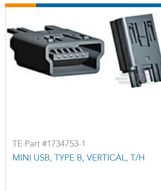
TE Part #1734753-1 MINI USB, TYPE B, VERTICAL, T/H