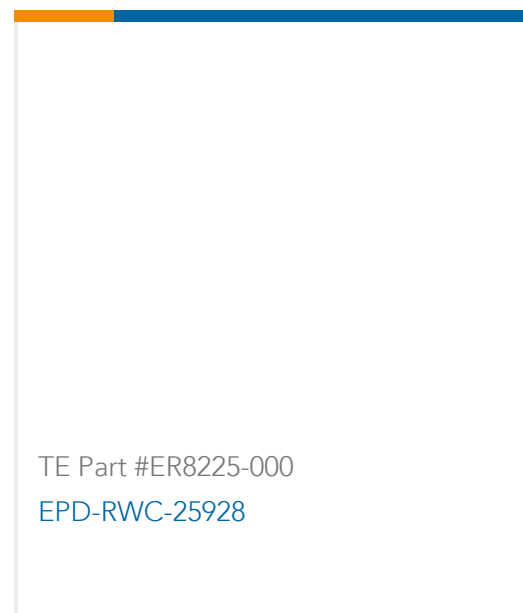
TE Part #ER8225-000 EPD-RWC-25928