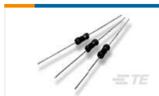
TE Part #4-1879350-2 RR01 5% 11R AMMO