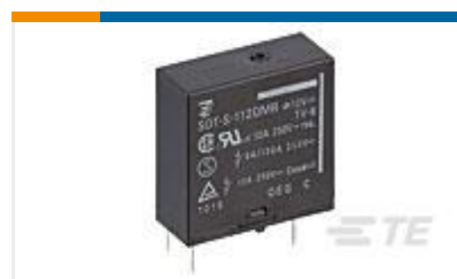
TE Part #8-1419125-5 SDT-S-106LMR,000