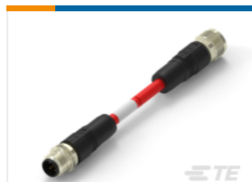
TE Part #TAA545B1411-060 M12A4-MS-FS-PVC-6.0M