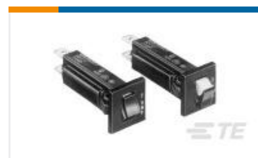
TE Part #1-1393250-7 W28-XQAT-15=W28