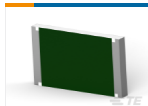
TE Part #8-2176407-8 3560 27R 5%