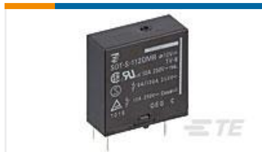
TE Part #8-1419125-5 SDT-S-106LMR,000