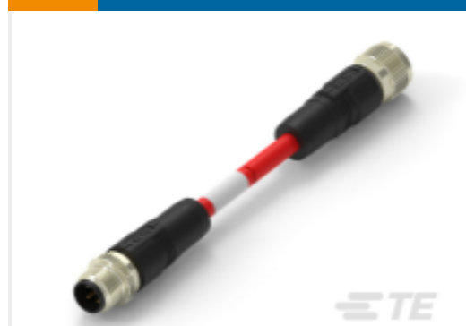
TE Part #TAA545B1411-060 M12A4-MS-FS-PVC-6.0M