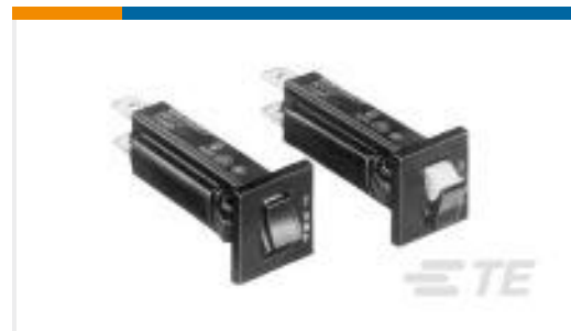
TE Part #1-1393250-7 W28-XQAT-15=W28