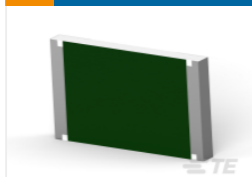
TE Part #8-2176407-8 3560 27R 5%