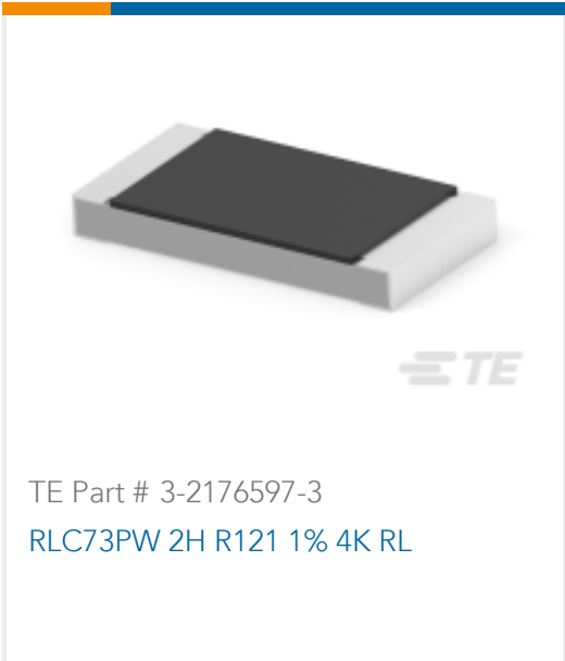
TE Part # 3-2176597-3 RLC73PW 2H R121 1% 4K RL