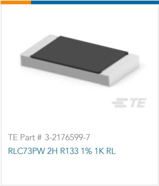
TE Part # 3-2176599-7 RLC73PW 2H R133 1% 1K RL