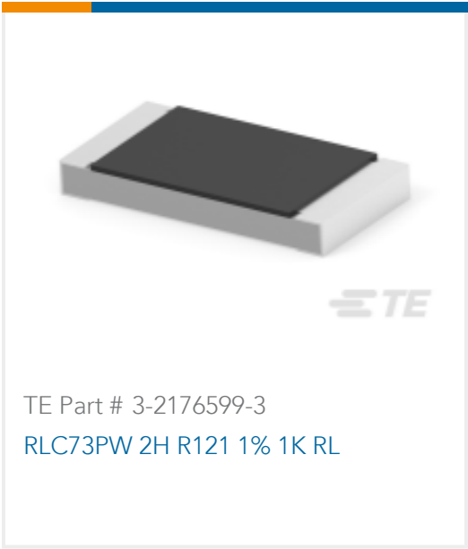
TE Part # 3-2176599-3 RLC73PW 2H R121 1% 1K RL