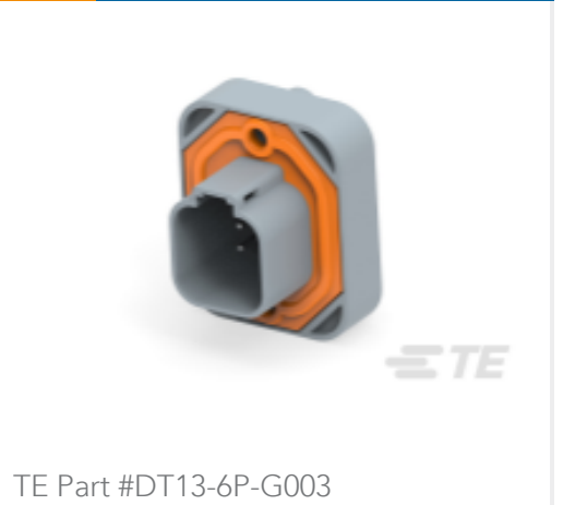
TE Part #DT13-6P-G003 HDR, 6P, GRY, RA, AU/NI/CU