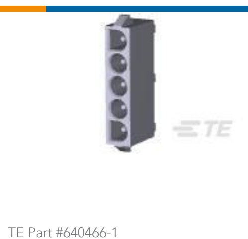
05P UMNL PIN HDR ASSY V2 NATL