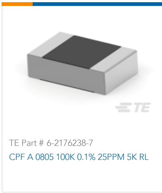
TE Part # 6-2176238-7 CPF A 0805 100K 0.1% 25PPM 5K RL