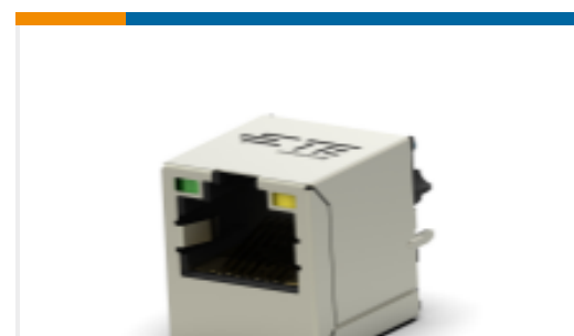
TE Part #5-2337993-2 RJ45 JACK MAG. POE 10/100 LED 1X1 VERT.