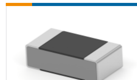
TE Part #7-1879417-7 CPF0603 768K 0.1% 25PPM 1K RL