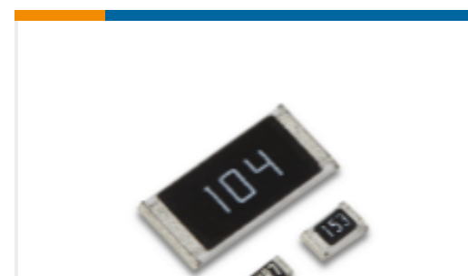
TE Part #4-2176347-7 CRGCO 2010 68K 1%