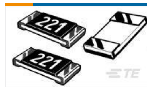
TE Part #1-2176232-7 3522 620K 1% 3W