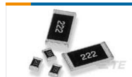
TE Part #5-1879501-9 CRGH2512 5% 270R 2W