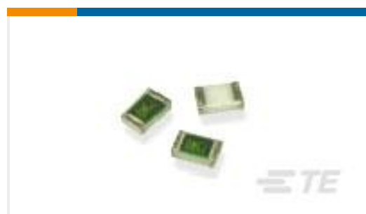
TE Part #2-1625868-8 RP 2A 0.25W 10R2 0.1% 25PPM 1K RL