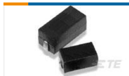
TE Part #7-1879233-3 SMW5 100R 5%