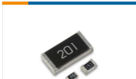
TE Part #2-2176330-4 CRGP 2010 820R 1%