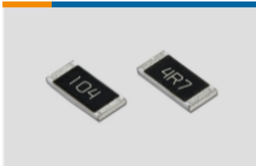
Surface Mount Resistors(211)