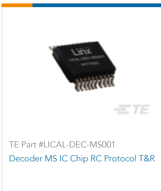
TE Part #LICAL-DEC-MS001 Decoder MS IC Chip RC Protocol T&R