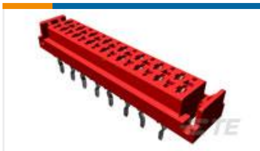
TE Part #338068-4 MICRO-MATCH FTE, 4P