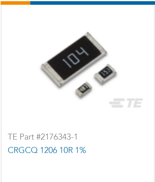
TE Part #2176343-1 CRGCQ 1206 10R 1%