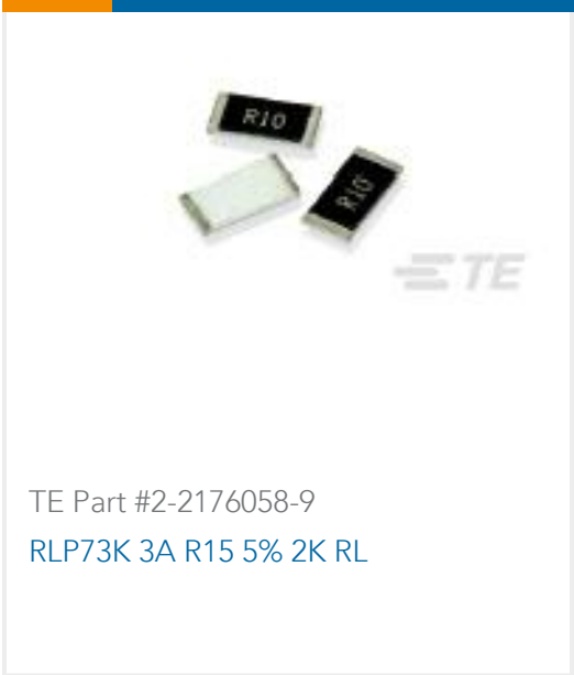
TE Part #2-2176058-9 RLP73K 3A R15 5% 2K RL