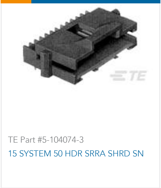
TE Part #5-104074-3 15 SYSTEM 50 HDR SRRA SHRD SN