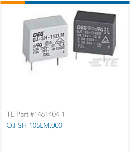
TE Part #1461404-1 OJ-SH-105LM,000