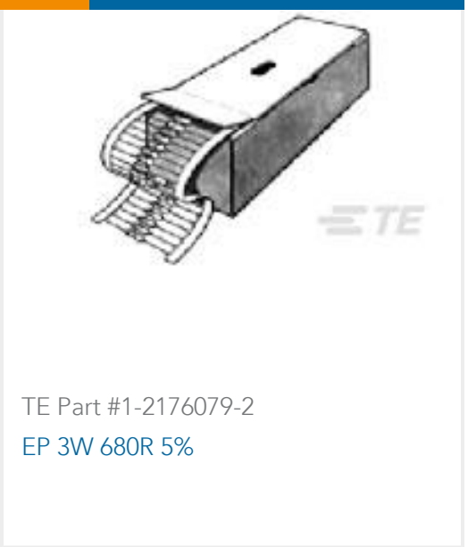
TE Part #1-2176079-2 EP 3W 680R 5%