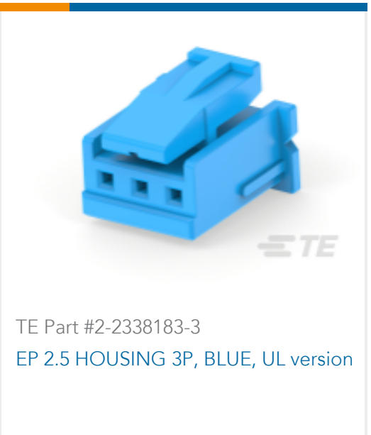
TE Part #2-2338183-3 EP 2.5 HOUSING 3P, BLUE, UL version