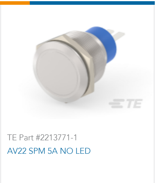
TE Part #2213771-1 AV22 SPM 5A NO LED