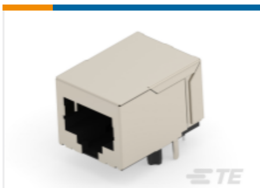
TE Part #203546-E MJIM IM 1X1 S 87 * X R THRU * * H3D01 *