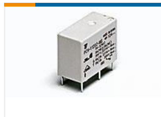
TE Part #1440004 PCH-112D2,000