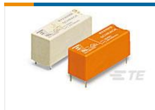
TE Part #3-1956170-0 RY213005R