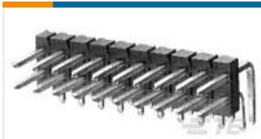
TE Part #825457-4 MOD 2 PINHDR 2X04P.