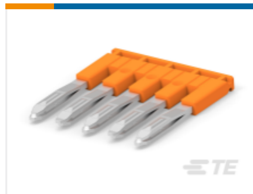
TE Part #1SNK905305R0000 JB5-5