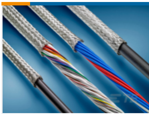
TE Part #CQ50573001 RAY-103-7.5(10)