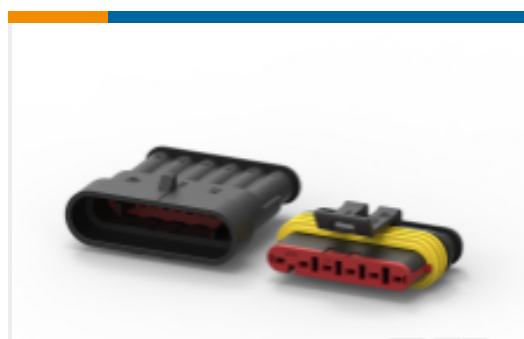
TE Part #282080-1 AMP SUPERSEAL 1.5MM, CONNECTOR HOUSING