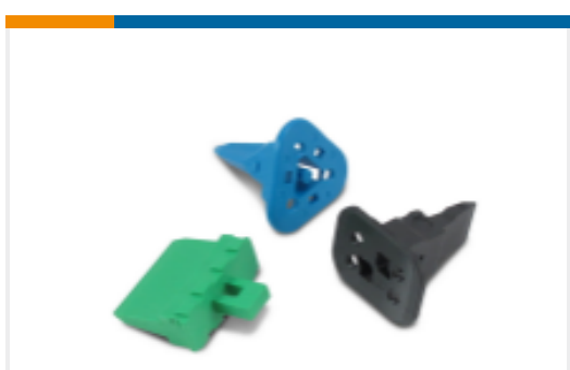
TE Part #W2P Wedgelocks: DEUTSCH DT