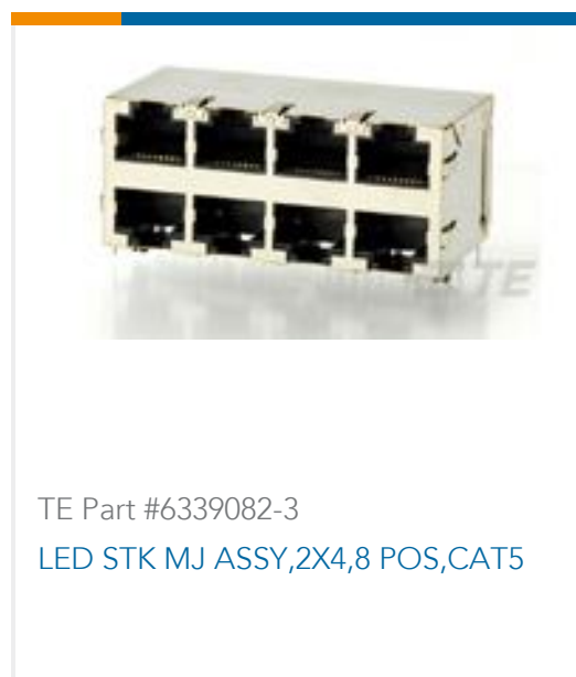
TE Part #6339082-3 LED STK MJ ASSY, 2X4, 8 POS, CAT5