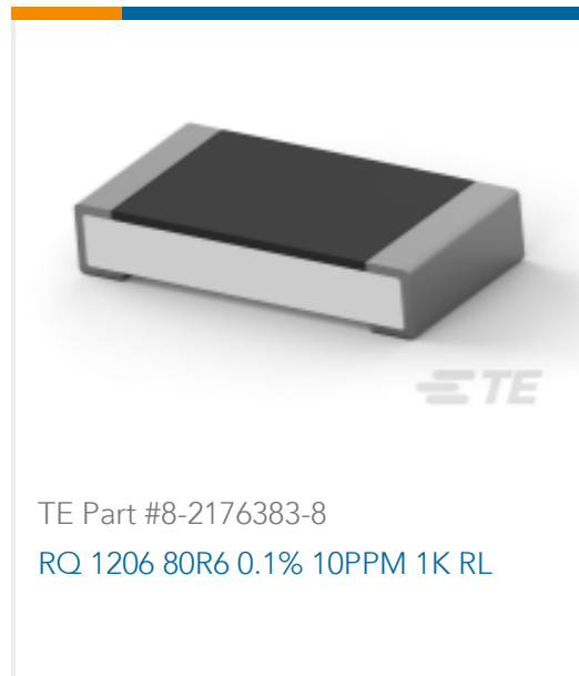
TE Part #8-2176383-8 RQ 1206 80R6 0.1% 10PPM 1K RL