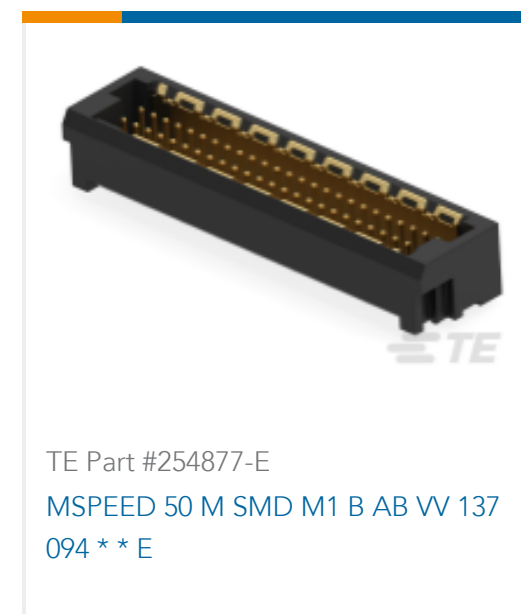
TE Part #254877-E MSPEED 50 M SMD M1 B AB VV 137 094 * * E