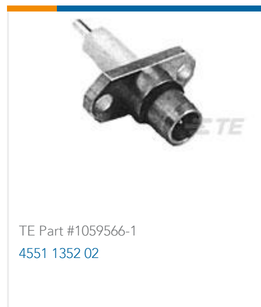
TE Part #1059566-1 4551 1352 02