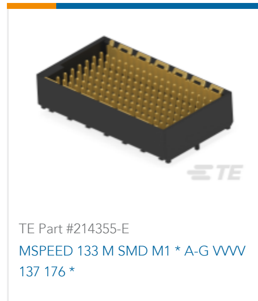
TE Part #214355-E MSPEED 133 M SMD M1 * A-G VVV 137 176 *