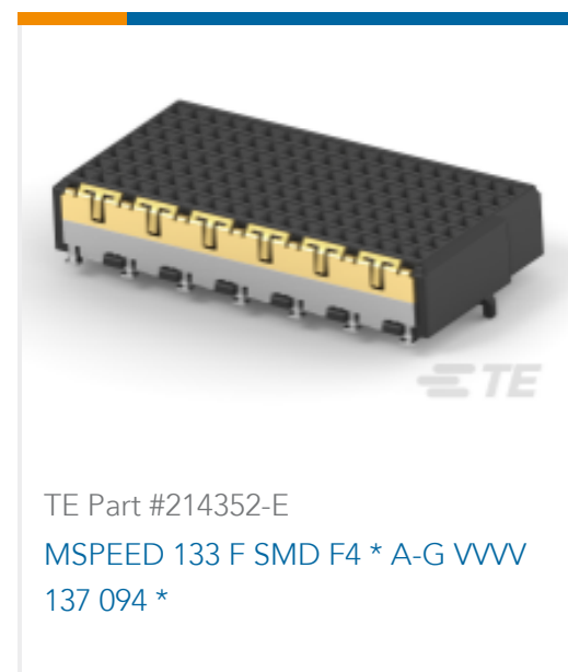
TE Part #214352-E MSPEED 133 F SMD F4 * A-G VVV 137 094 *