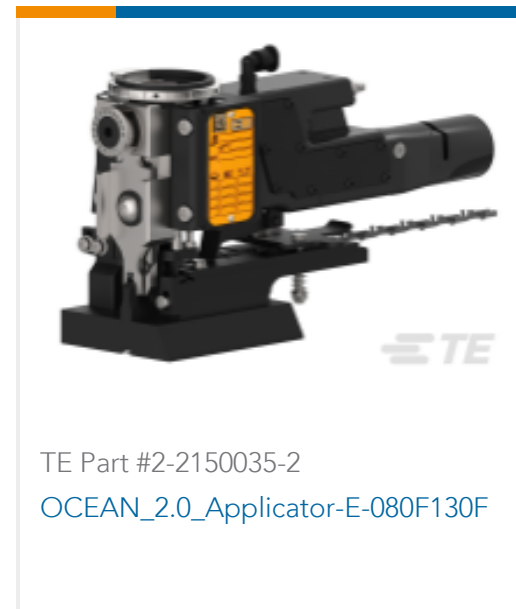
TE Part #2-2150035-2 OCEAN_2.0_Applicator-E-080F130F