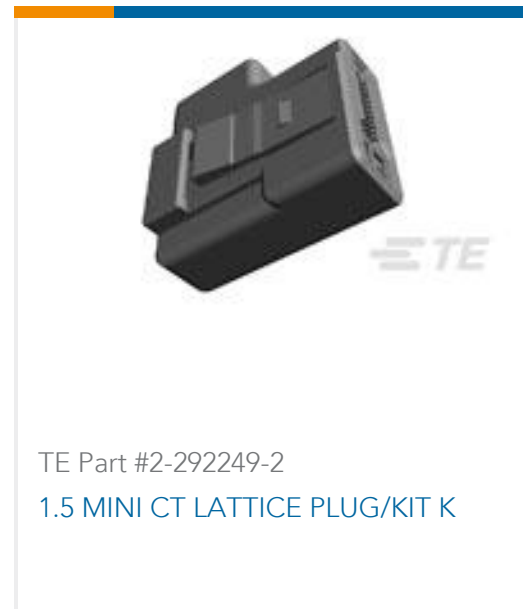
TE Part #2-292249-2 1.5 MINI CT LATTICE PLUG/KIT K