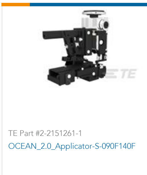
TE Part #2-2151261-1 OCEAN_2.0_Applicator-S-090F140F