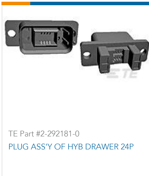
TE Part #2-292181-0 PLUG ASS'Y OF HYB DRAWER 24P