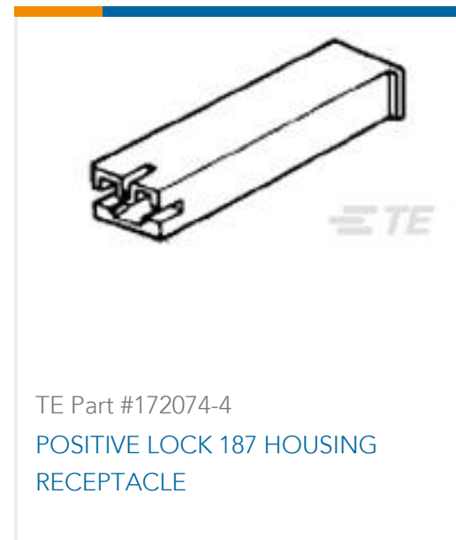
TE Part #172074-4 POSITIVE LOCK 187 HOUSING RECEPTACLE