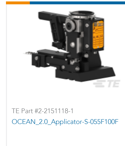
TE Part #2-2151118-1 OCEAN_2.0_Applicator-S-055F100F