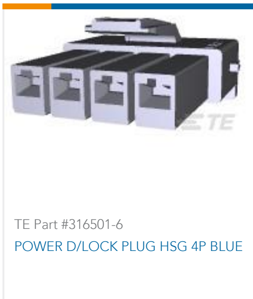
TE Part #316501-6 POWER D/LOCK PLUG HSG 4P BLUE