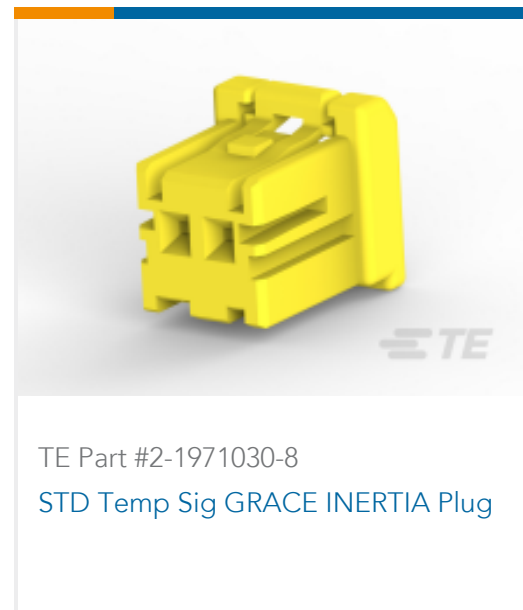
TE Part #2-1971030-8 STD Temp Sig GRACE INERTIA Plug