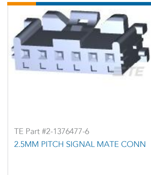
TE Part #2-1376477-6 2.5MM PITCH SIGNAL MATE CONN RECEPTACLE