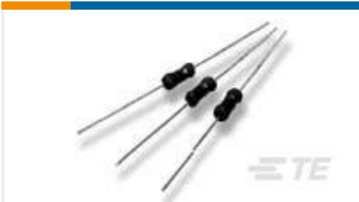
TE Part #5-1625892-7 3W SM M/OX 5% 51K