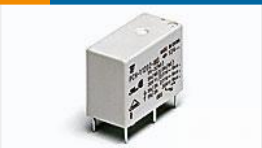
TE Part #1461353-2 PCH-105L2MH,000