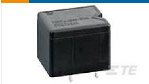
TE Part #1393277-6 V23076A1001D143