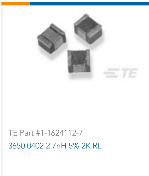
TE Part #1-1624112-7 3650 0402 2.7nH 5% 2K RL