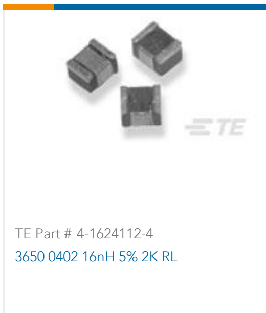
TE Part # 4-1624112-4 3650 0402 16nH 5% 2K RL