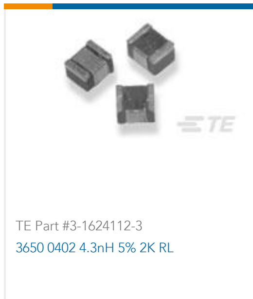
TE Part #3-1624112-3 3650 0402 4.3nH 5% 2K RL