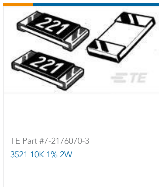
TE Part #7-2176070-3 3521 10K 1% 2W