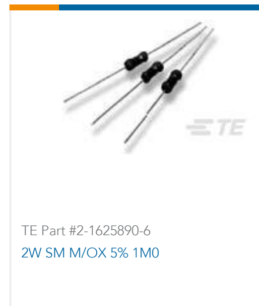
TE Part #2-1625890-6 2W SM M/OX 5% 1M0