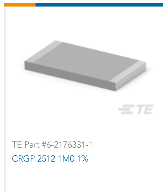
TE Part #6-2176331-1 CRGP 2512 1M0 1%