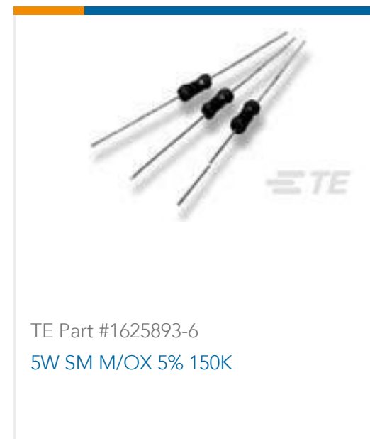
TE Part #1625893-6 5W SM M/OX 5% 150K