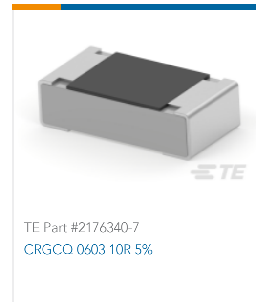
TE Part #2176340-7 CRGCO 0603 10R 5%