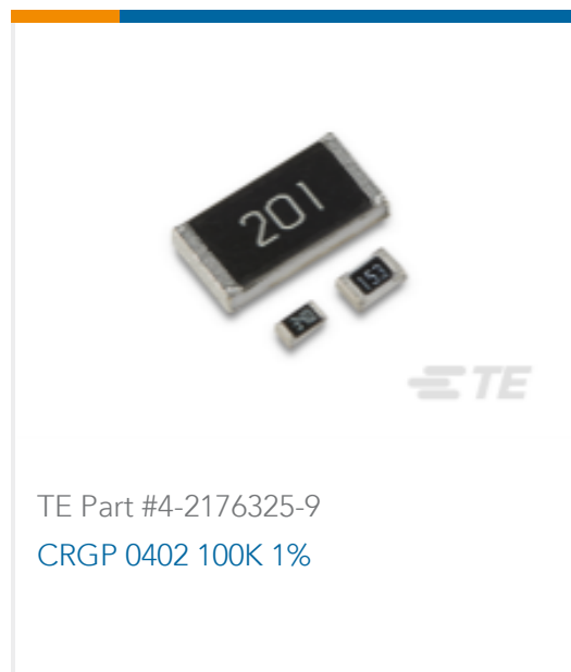
TE Part #4-2176325-9 CRGP 0402 100K 1%