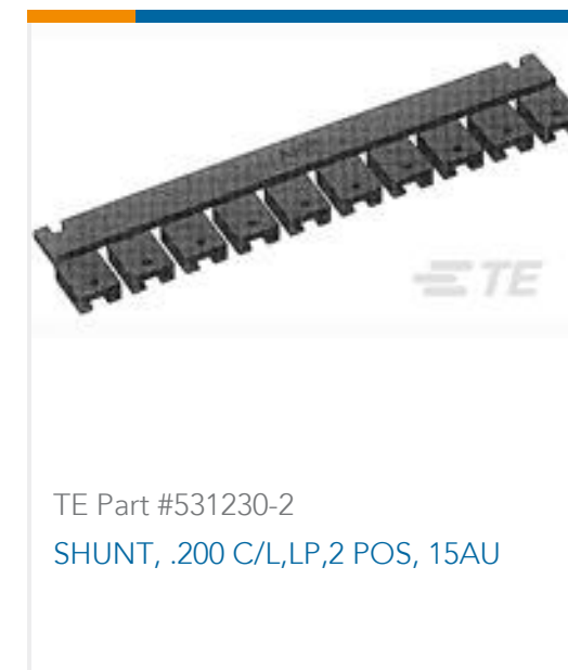
TE Part #531230-2 SHUNT, .200 C/L,LP,2 POS, 15AU