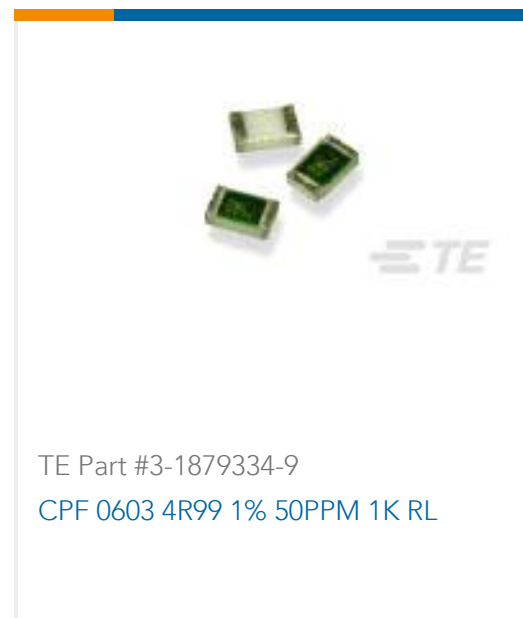
TE Part #3-1879334-9 CPF 0603 4R99 1% 50PPM 1K RL