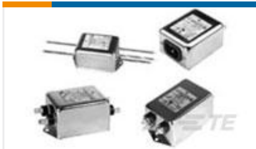
TE Part #6609032-6 3VR3=F7199 S0