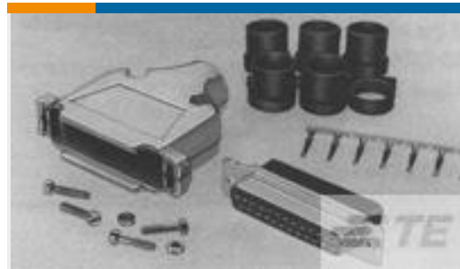
TE Part #749806-9 KIT,HDP-20,RCPT,SIZE 3, 25 POS