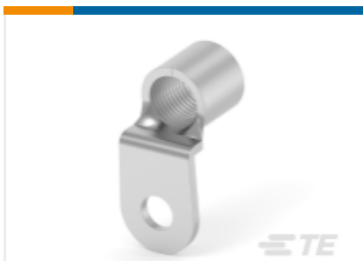
TE Part #320383-1 TERMINAL,SOLIS R 2 1/4 90DEG