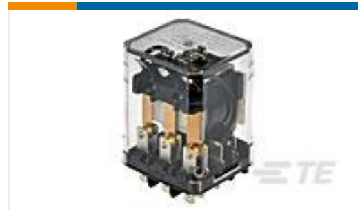
TE Part #1393118-2 KUP-14A55-24=KU