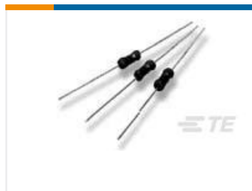
TE Part #1-1879353-4 RR02 5% 15K AMMO