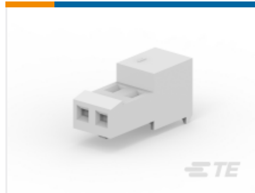
TE Part #3-640440-3 MTA Receptacle: Nylon, Tin Plated, 2.54 mm