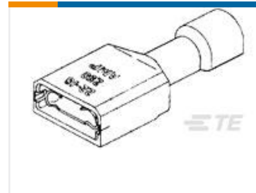
TE Part #2-520273-2 ULTRAFast 110 ASSY REC 22-18 TPBR LP