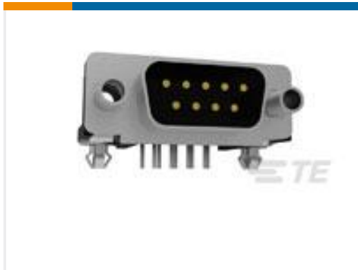
TE Part #5747844-6 09 MSFL RCPT RA 318 (SL,FM,BL)