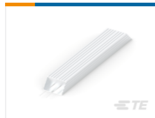
TE Part #1-2176510-3 CJP 500W 15R 5% Lead