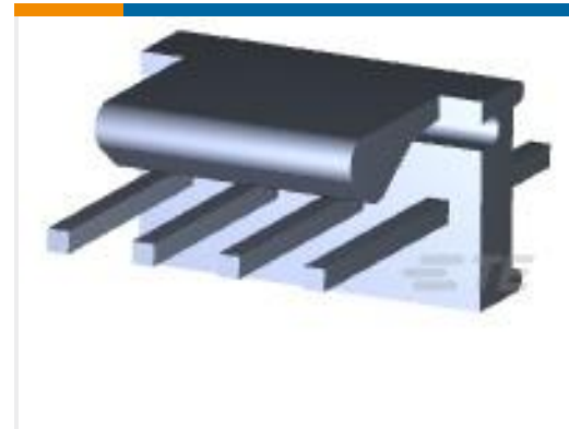
TE Part #640456-4 04P MTA100 HDR ASSY F/L SQ STR