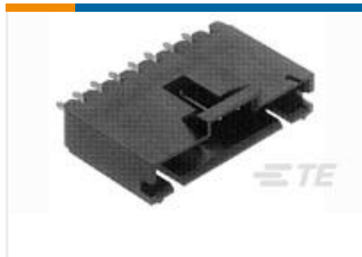
TE Part #103638-4 05 MTE HDR SRST LATCH .100CL