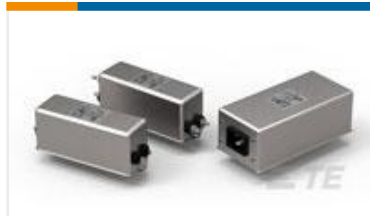
TE Part #4-1609037-2 20EHQ1=F8371