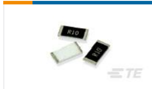
TE Part #3-1879462-3 RL73H 2B R36 1% 1K RL