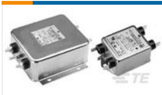
TE Part #6609042-3 10VS1=F7248 S0