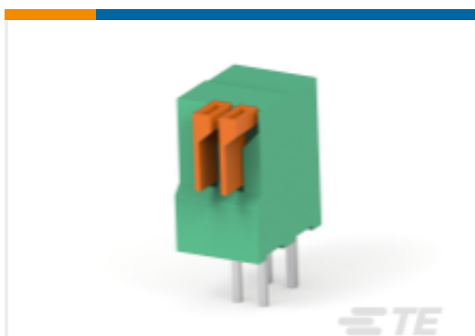
TE Part #1-2834015-2 2POS 2.54MM TES CONN.