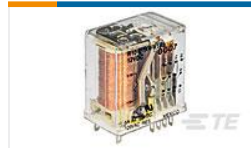
TE Part #1-1393767-5 R10-E2X2-V700=R10