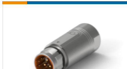
TE Part #BKA199M24580200000 923 EXTENSION, SPEEDTEC-READY