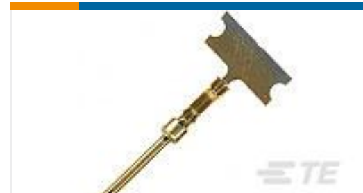
TE Part #166293-1 LP HD20 COSI PIN CONTACT DF; 24-20 AWG