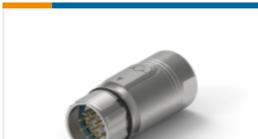
TE Part #AKA020M04620200000 623 EXTENSION, SPEEDTEC-READY