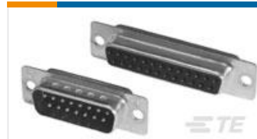
TE Part #5-747912-2 25 Plug Solder Cup, Gold Flash