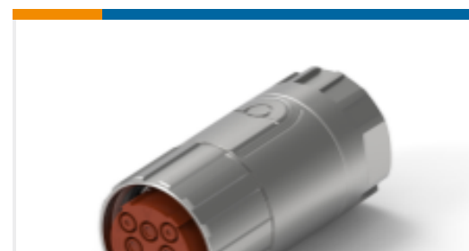
TE Part #CSA263F53260001000 940 PLUG