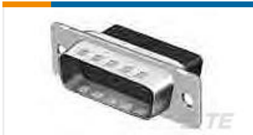
TE Part #167293-1 15P.HDP20 PLUG ASSY