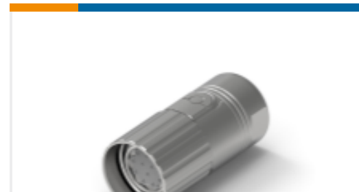
TE Part #ASA021F01620235000 623 PLUG