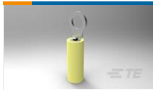
TE Part #323912 TERMINAL,PIDG R 26-22 2