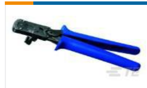
TE Part #169994-1 POS.LOCK H.T.4,8