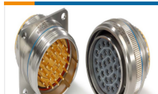
TE Part #ZPF000000000037467 983-6W 16-10 PN