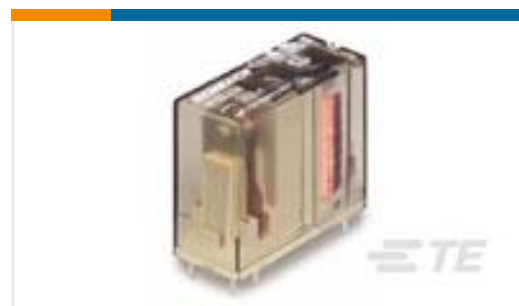
TE Part #1-1393230-1 RP3SL024