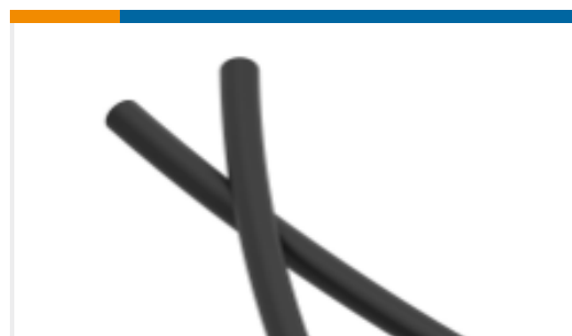
TE Part #NB14032001 TAT-125-3/16-0-STK