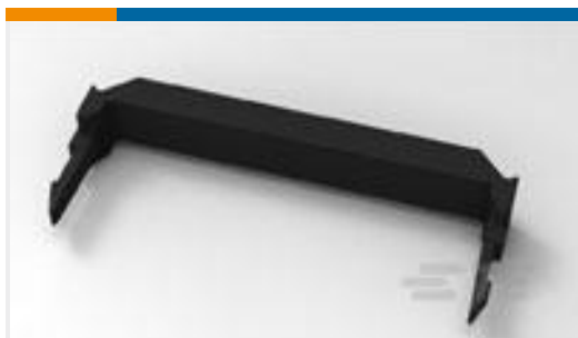
TE Part #499252-8 016 STRAIN RELIEF A-L RCPT