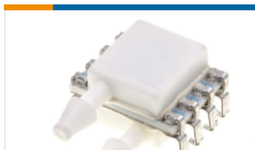
TE Part #4525-DS3A001DP 1PSI DP PRESSURE SENSOR 10% TO 90%