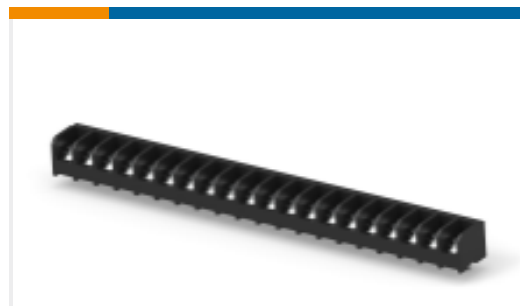
TE Part #8-1546158-0 6PCV-20-323=W/PP