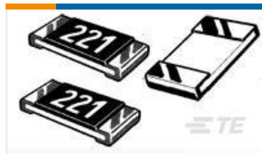
TE Part #9-2176070-1 3521 56K 1% 2W