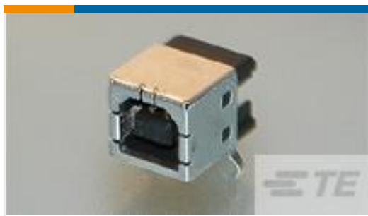
TE Part #292304-5 STD USB TYPE B, R/A, T/H, 30U" AU