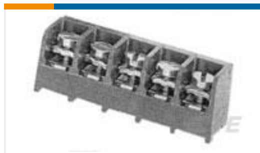
TE Part #9-1437652-6 6PCV-06-007=6PCV ASSY