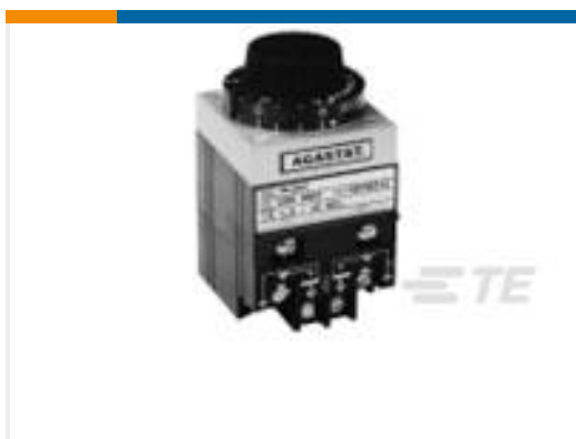
TE Part #2-1423157-0 7012AH=RLY,STD,ON,2P,120VAC,30