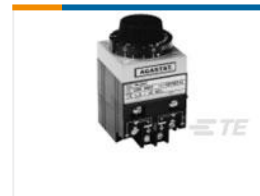
TE Part #2-1423157-4 7012AK=RLY,STD,ON,2P,120VAC,30