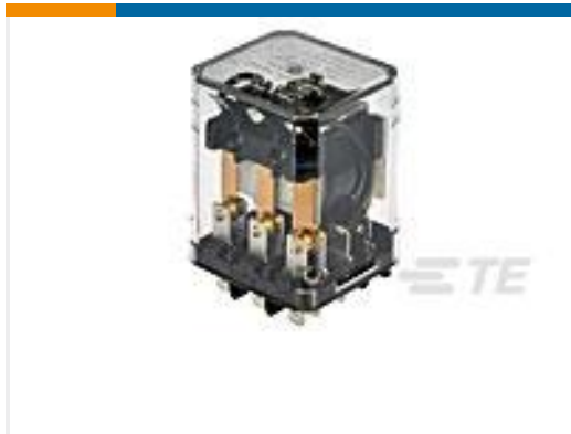
TE Part #1-1393118-2 KUP-14D15-110=KU