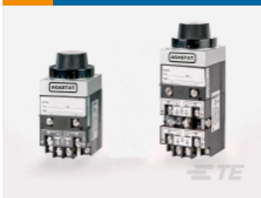
TE Part # 1-1423159-9 7012PB=RLY,STD,ON,2P,125VDC, 5