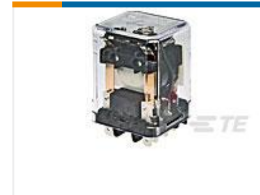
TE Part #9-1393113-7 KUEP-3D15-110=KU