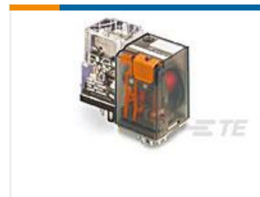
TE Part #4-1393104-2 KRPA-11DG-110=KRPA