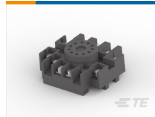
TE Part #2-1419106-4 27E892=SOCKET,KRPA,11,OCTAL,PO