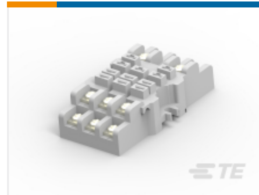
TE Part #1393143-5 27E121=SOCKET,KUP,11,SCW,PLE