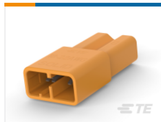
TE Part #2271183-1 RECEPTACLE, 2PINS WIRE TO WIRE CONNECTOR