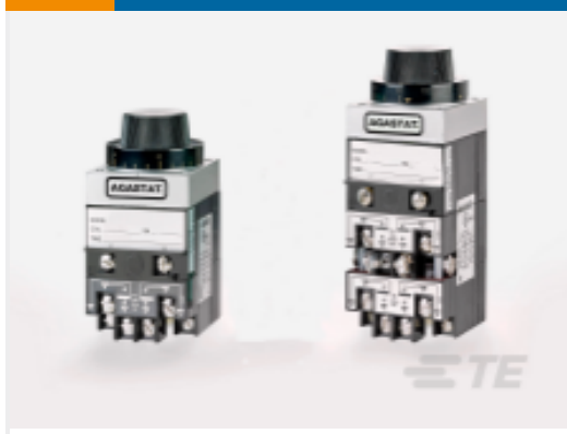
TE Part # 1-1423159-9 7012PB=RLY,STD,ON,2P,125VDC, 5