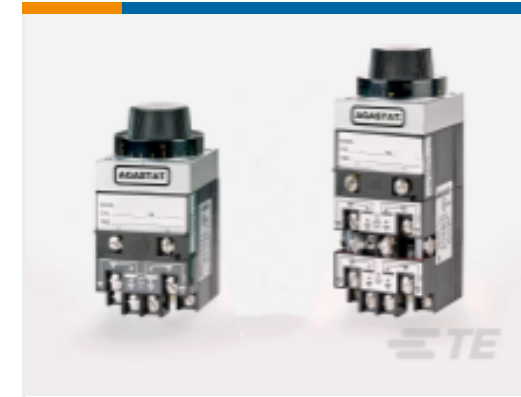
TE Part #7-1437446-0 7012PALL=RLY,STD,ON,2P,125VDC