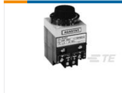
TE Part #1423157-6 7012ACL=RLY,STD,ON,2P,120VAC,1