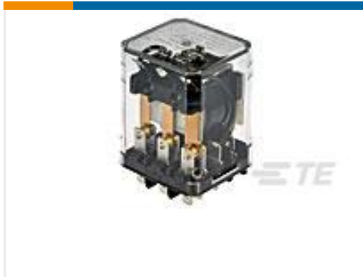
TE Part #1-1393118-2 KUP-14D15-110=KU