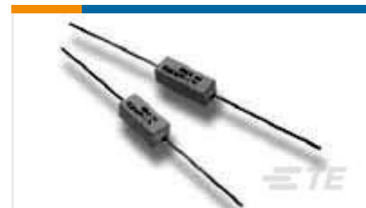
TE Part #1623819-9 SBL4 R022 5%