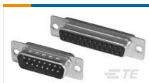
TE Part #5-747909-2 15 Rcpt Solder Cup, Gold Flash