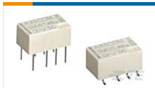
TE Part #1462037-4 IM01TS=IM RELAY 140mW 3V