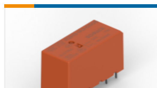
TE Part #5-1415543-7 RZH3-1A3-D005