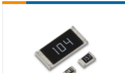
TE Part #5-2176343-1 CRGCQ 1206 150K 1%