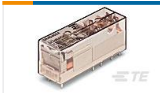
TE Part #4-1415053-1 SR4M4024