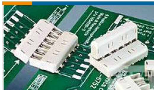
TE Part #1-1954289-1 Connector,Blade & Recept 2 Pos