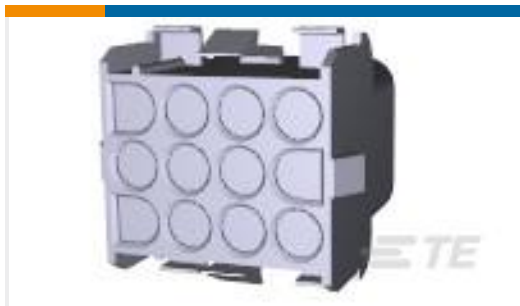
TE Part #1-480709-0 12P UMNL CAP HSG NATL