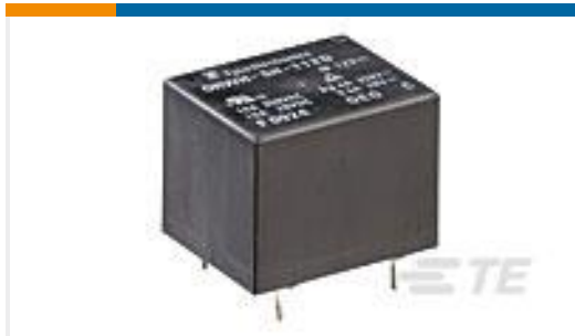
TE Part #1-1721150-5 ORWH-SH-124D1F,000