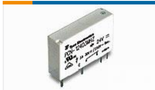
TE Part #3-1461491-6 PCN-124D3MHZ,000