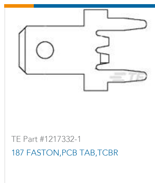
TE Part #1217332-1 187 FASTON,PCB TAB,TCBR