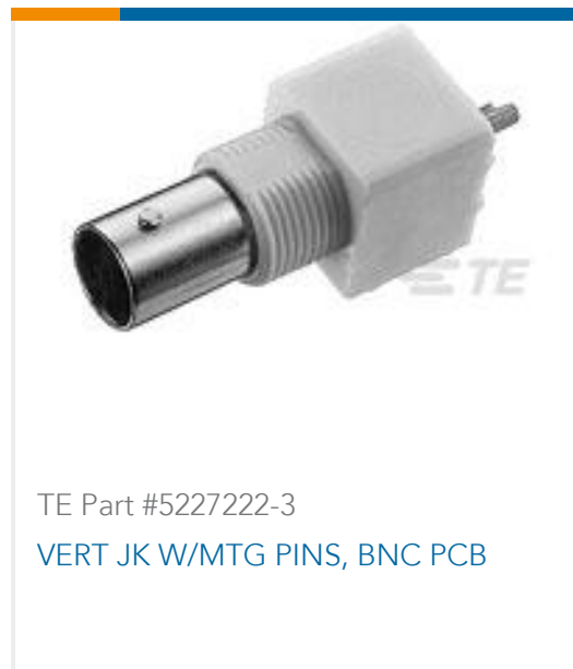
TE Part #5227222-3 VERT JK W/MTG PINS, BNC PCB