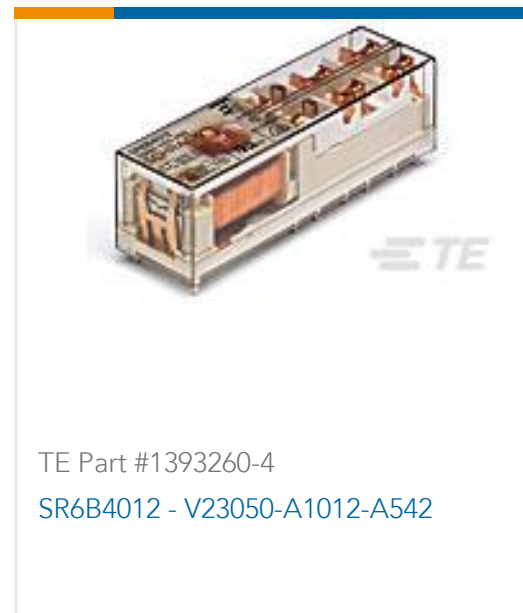
TE Part #1393260-4 SR6B4012 - V23050-A1012-A542