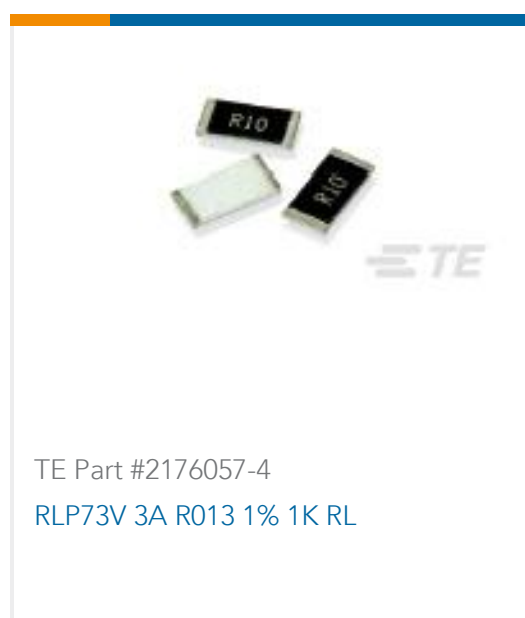
TE Part #2176057-4 RLP73V 3A R013 1% 1K RL