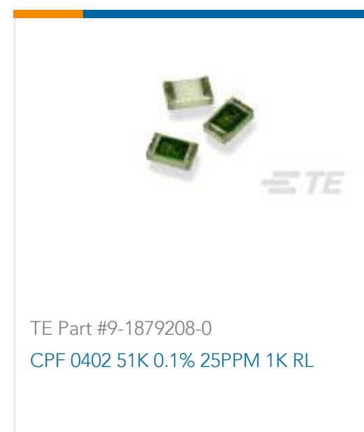
TE Part #9-1879208-0 CPF 0402 51K 0.1% 25PPM 1K RL