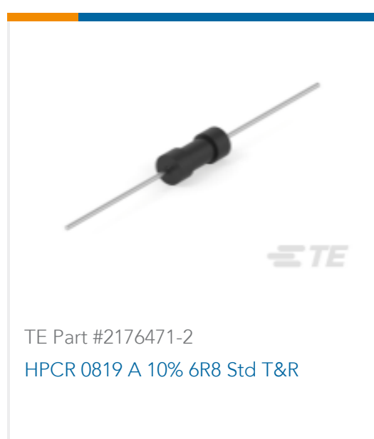
TE Part #2176471-2 HPCR 0819 A 10% 6R8 Std T&R