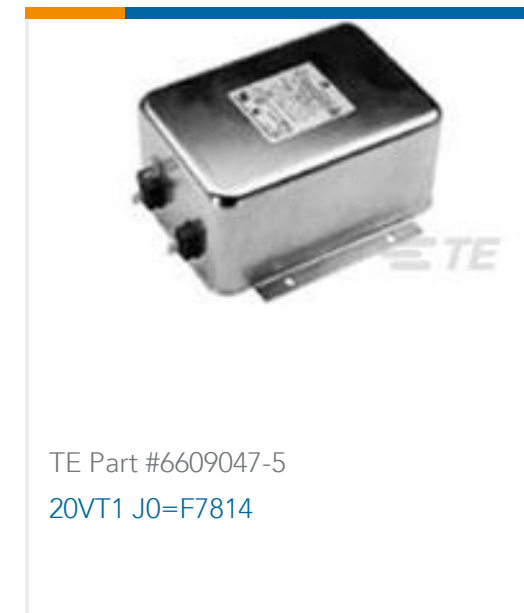
TE Part #6609047-5 20VT1 J0=F7814