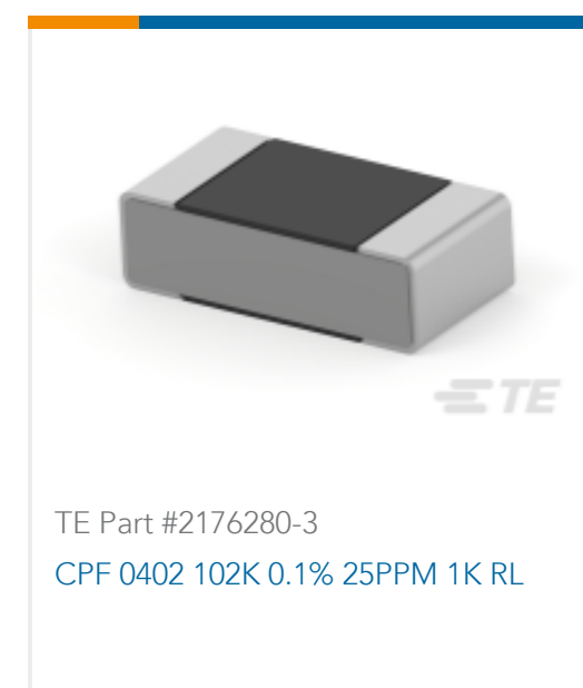
TE Part #2176280-3 CPF 0402 102K 0.1% 25PPM 1K RL