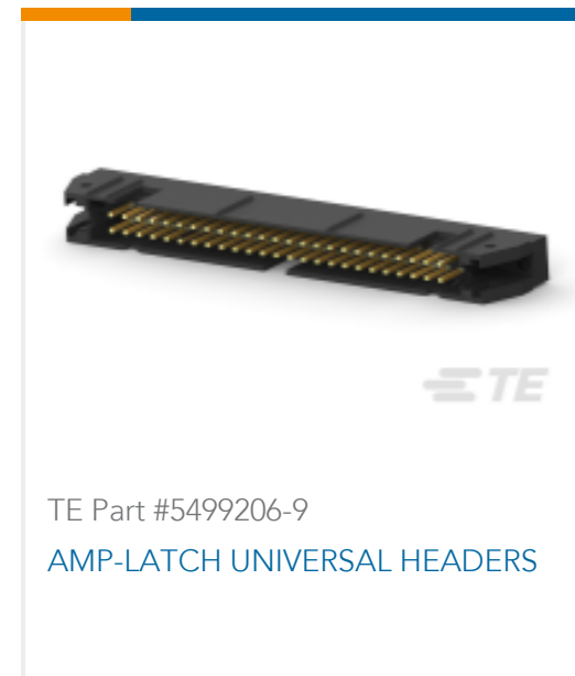
TE Part #5499206-9 AMP-LATCH UNIVERSAL HEADERS