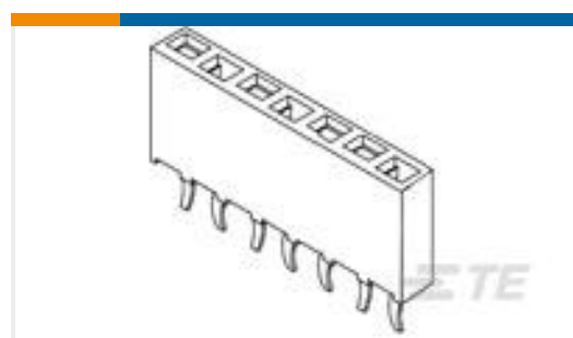
TE Part #1-215297-4 14P HV100 REC CON. TE, 7.0MM