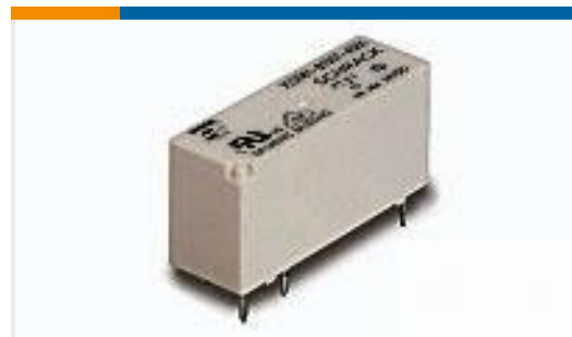
TE Part #2-1393222-0 V23061A1005A302=MINISTARKSTROM