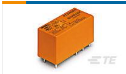
TE Part #1415898-1 RTS3T024