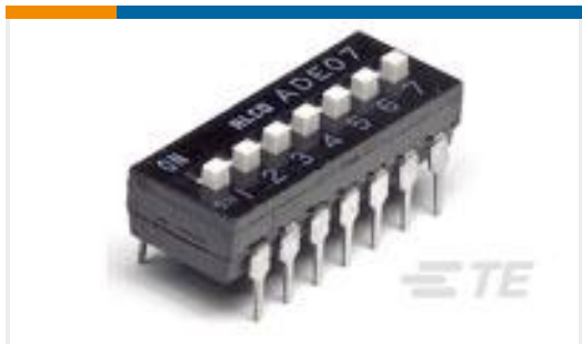
TE Part #1825057-1 ADE0204=DIP SWITCH,EXT,THRU/HL