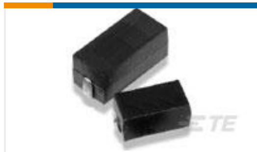
TE Part #3-1879021-5 SMW3 2R7 5%