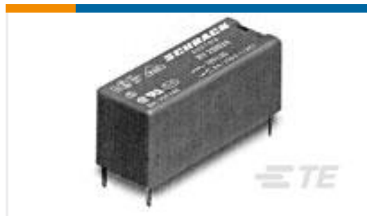
TE Part #4-1393224-6 RY211012