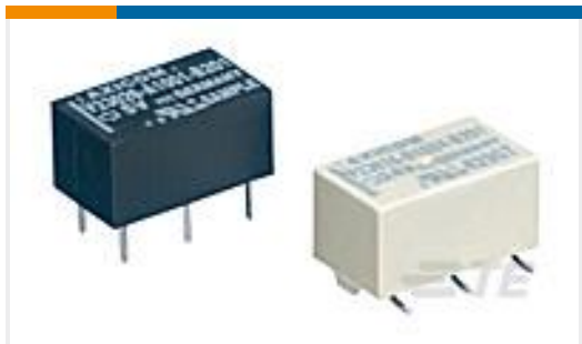
TE Part #1393774-8 V23026A1002B201