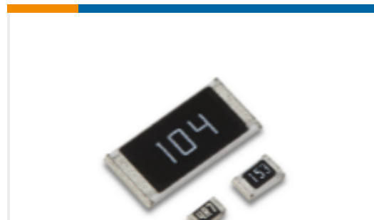
TE Part #2176347-5 CRGCO 2010 22R 1%