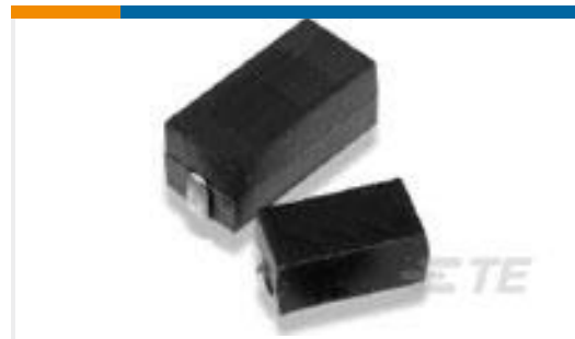
TE Part #6-1676966-9 SMW2 68R 5%