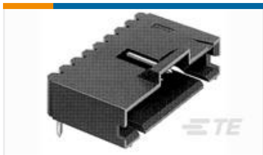
TE Part #5-103634-4 05 MTE HDR SRRRA LATCH.100CL LF TRAY