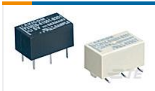
TE Part #1393774-1 V23026A1001B201