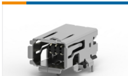
TE Part #2294415-1 INDUSTRIAL MINI I/O HDR TYPE I TRAY