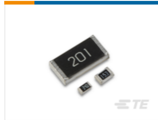
TE Part #2-2176328-5 CRGP 1206 1K0 1%