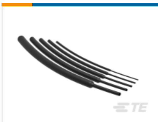
TE Part #NB13052001 RNF-100-1-BK-STK