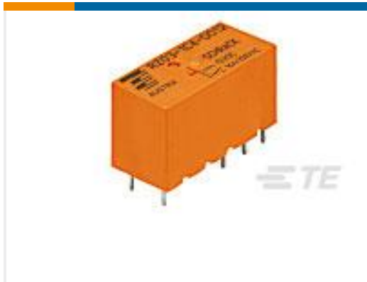
TE Part #1-1415899-6 RZ03-1A4-D012