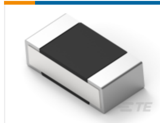
TE Part #2176307-8 RP 1E 0.1W 14K7 0.1% 25PPM 5K RL