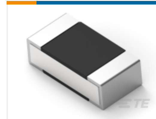
TE Part #8-2176306-1 RP 1E 0.1W 7K87 0.1% 25PPM 5K RL