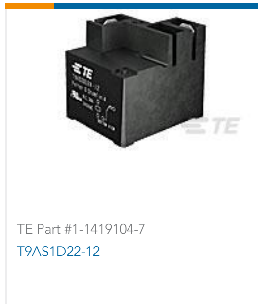
TE Part #1-1419104-7 T9AS1D22-12