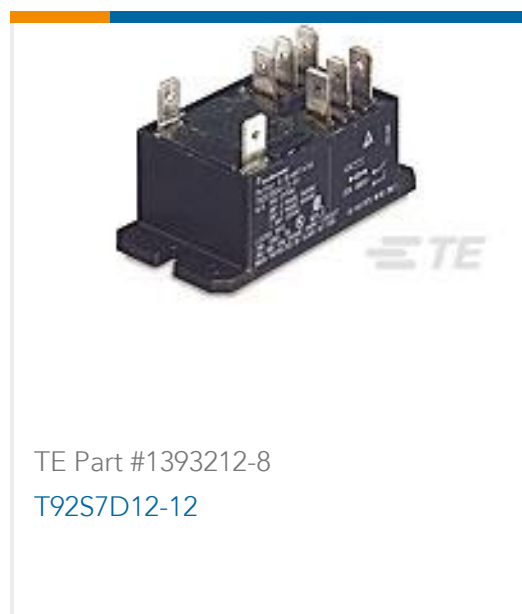
TE Part #1393212-8 T92S7D12-12