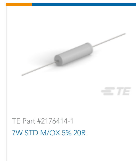
TE Part #2176414-1 7W STD M/OX 5% 20R