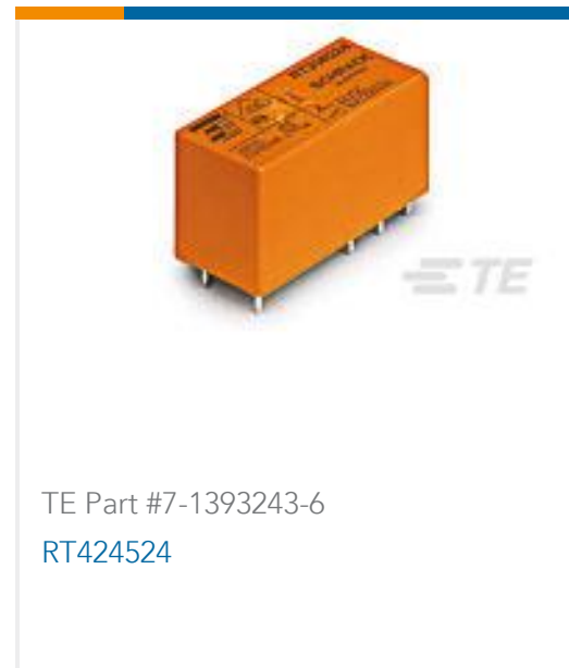
TE Part #7-1393243-6 RT424524