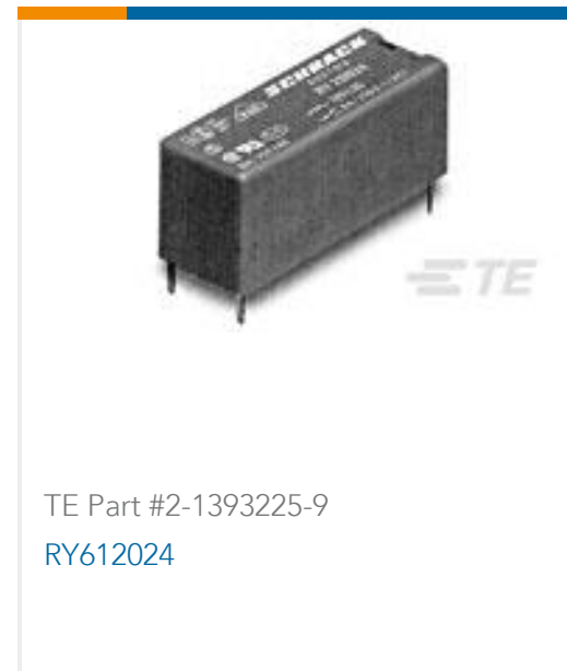
TE Part #2-1393225-9 RY612024