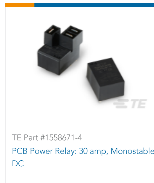
TE Part #1558671-4 PCB Power Relay: 30 amp, Monostable DC