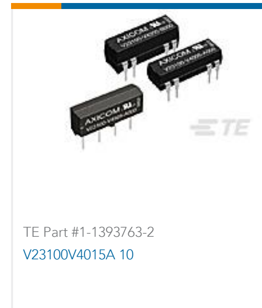
TE Part #1-1393763-2 V23100V4015A 10