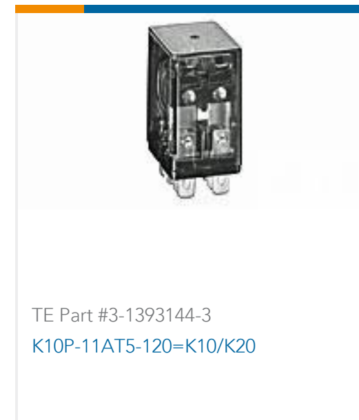
TE Part #3-1393144-3 K10P-11AT5-120=K10/K20