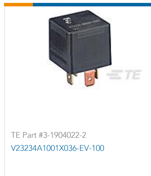
TE Part #3-1904022-2 V23234A1001X036-EV-100