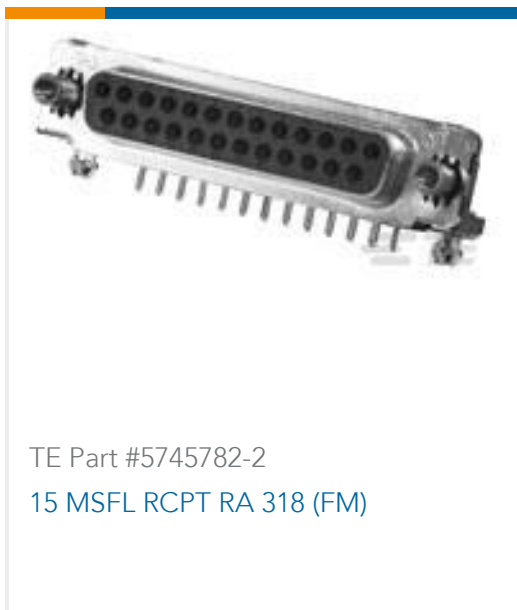
TE Part #5745782-2 15 MSFL RCPT RA 318 (FM)