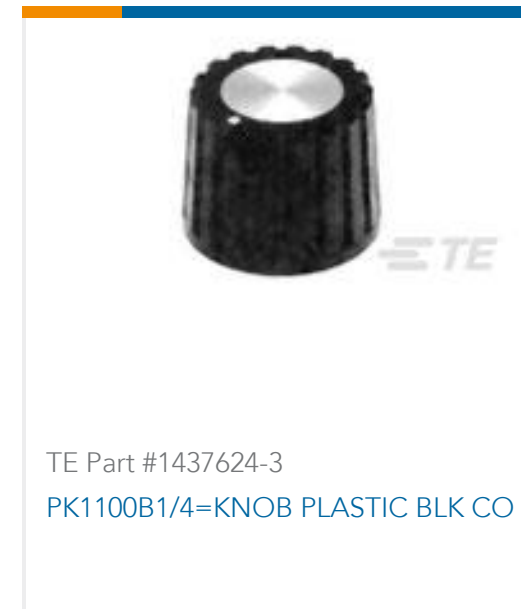
TE Part #1437624-3 PK1100B1/4=KNOB PLASTIC BLK CO