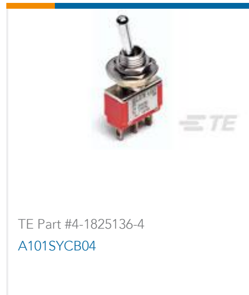
TE Part #4-1825136-4 A101SYCB04