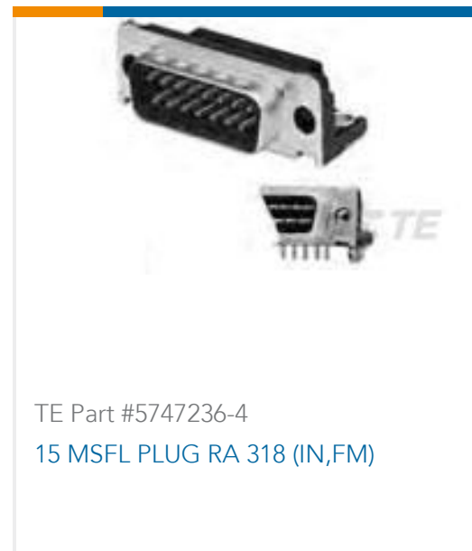
TE Part #5747236-4 15 MSFL PLUG RA 318 (IN,FM)