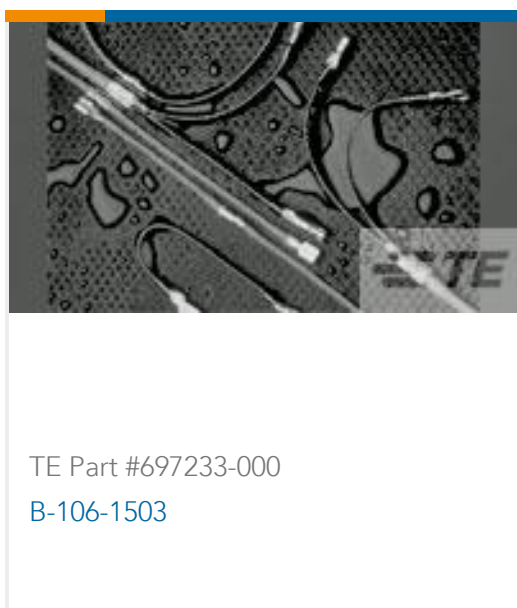
TE Part #697233-000 B-106-1503