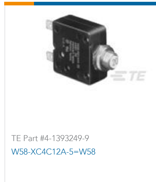
TE Part #4-1393249-9 W58-XC4C12A-5=W58