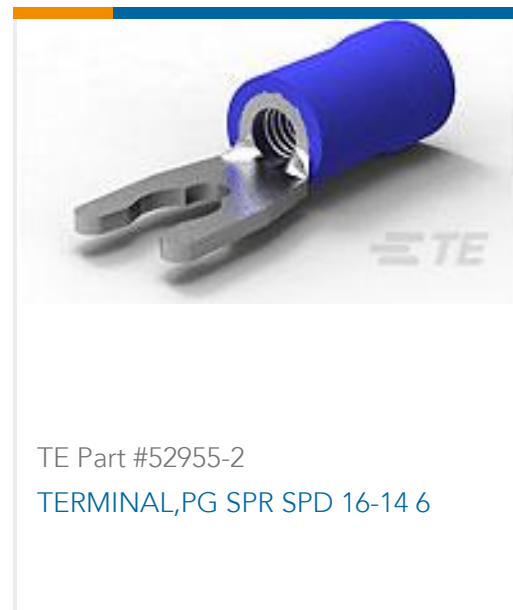
TE Part #52955-2 TERMINAL,PG SPR SPD 16-14 6