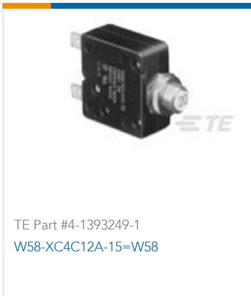
TE Part #4-1393249-1 W58-XC4C12A-15=W58