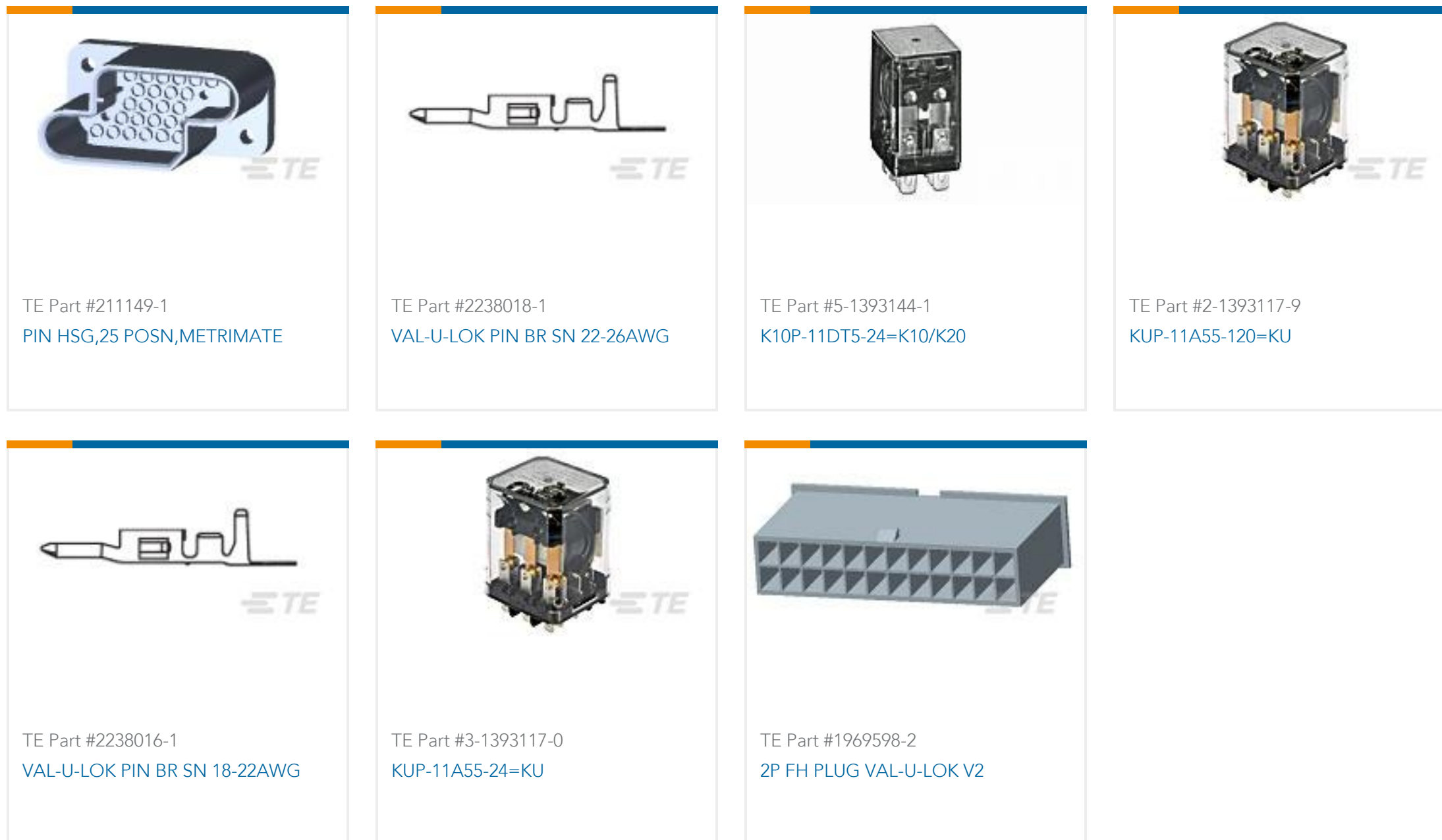
TE Part #211149-1 PIN HSG,25 POSN,METRIMATE