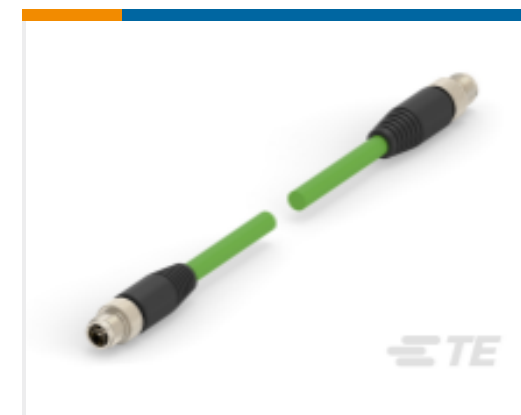
TE Part #TAX38725102-002 RPC-M12X-8MS-1.0SH-M12X-8MS-PUR