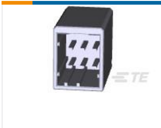
TE Part #1318124-2 DYNAMIC D2100 HDR V ASSY 6P Y