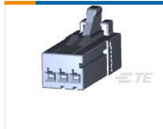
TE Part #2-1318120-3 DYNAMIC D2100 REC HSG 3P SGL Y