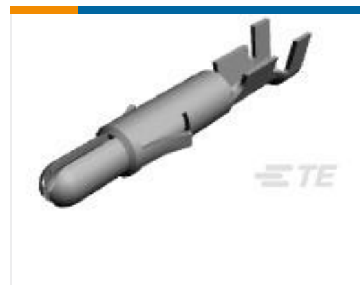
TE Part #350706-7 UMNL SPLIT PIN 24-18 AUBR L/P