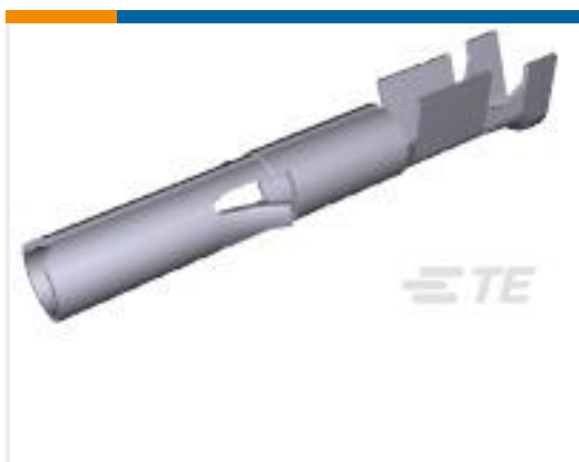
TE Part #350689-3 UMNL SOK 24-18 PTPPHBZ L/P