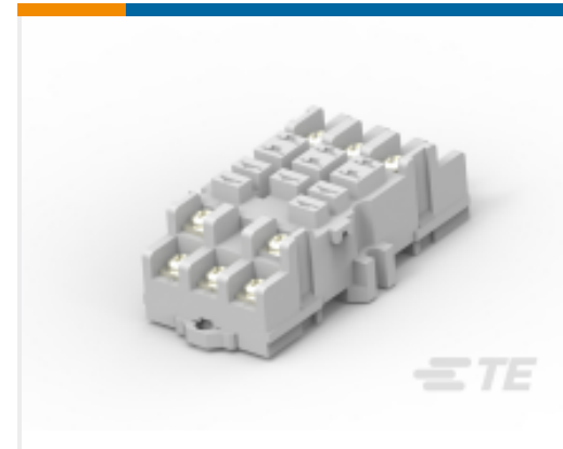
TE Part #2-1419106-5 27E893=SOCKET,KU,11,OC,POLY,NA-