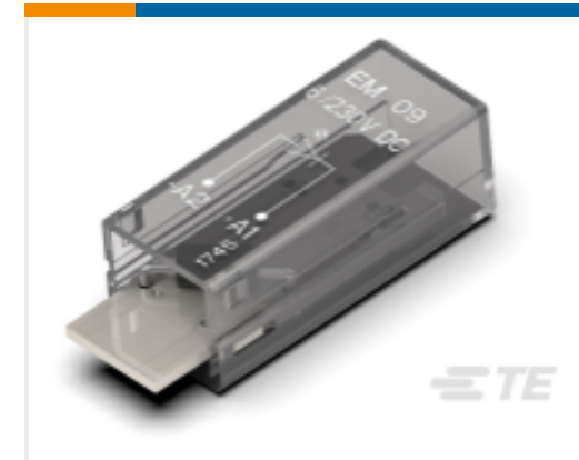
TE Part #9-1415036-1 PTMT00A0