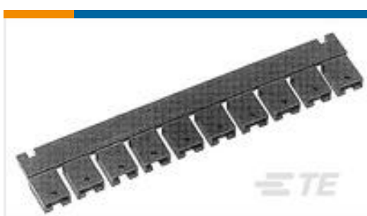
TE Part #2-382811-0 ECONOMY SHUNT, 30 AU BLACK