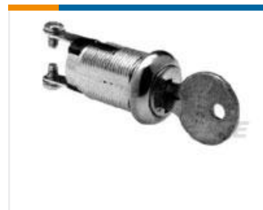
TE Part #2-1437597-7 2SWK231AL101=non ul keylock