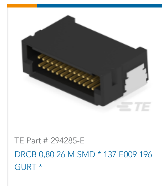
Also in the Series | ERNI MicroCon